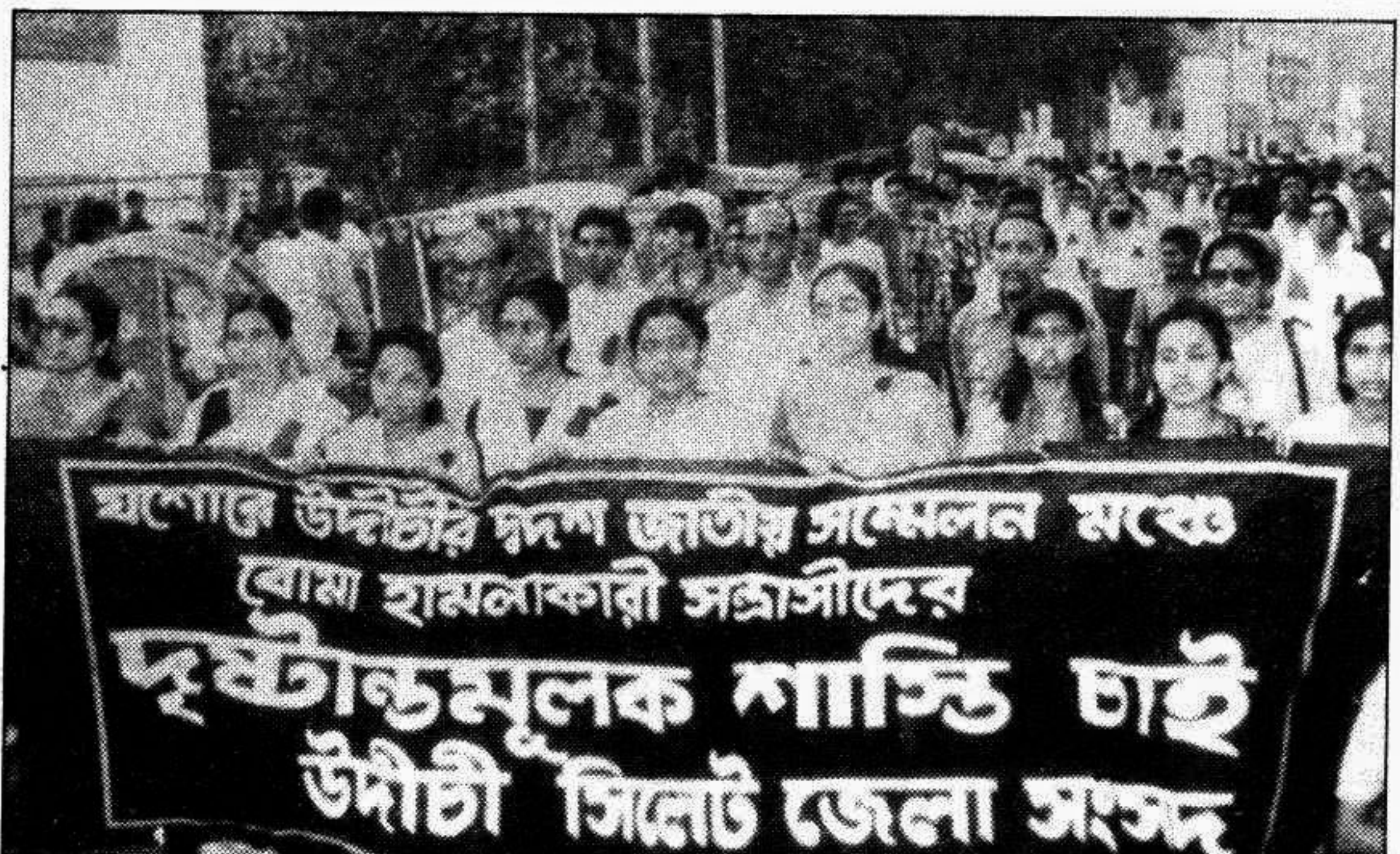
SYLHET: The Sylhet unit of Udichi Shilpi Gosthi brought out a procession in the town demanding punishment to those responsible for the bomb attack in Jessore.

About eight lakh people of these areas are benefitted by the project. The project area is covered by 65 miles of embankment.