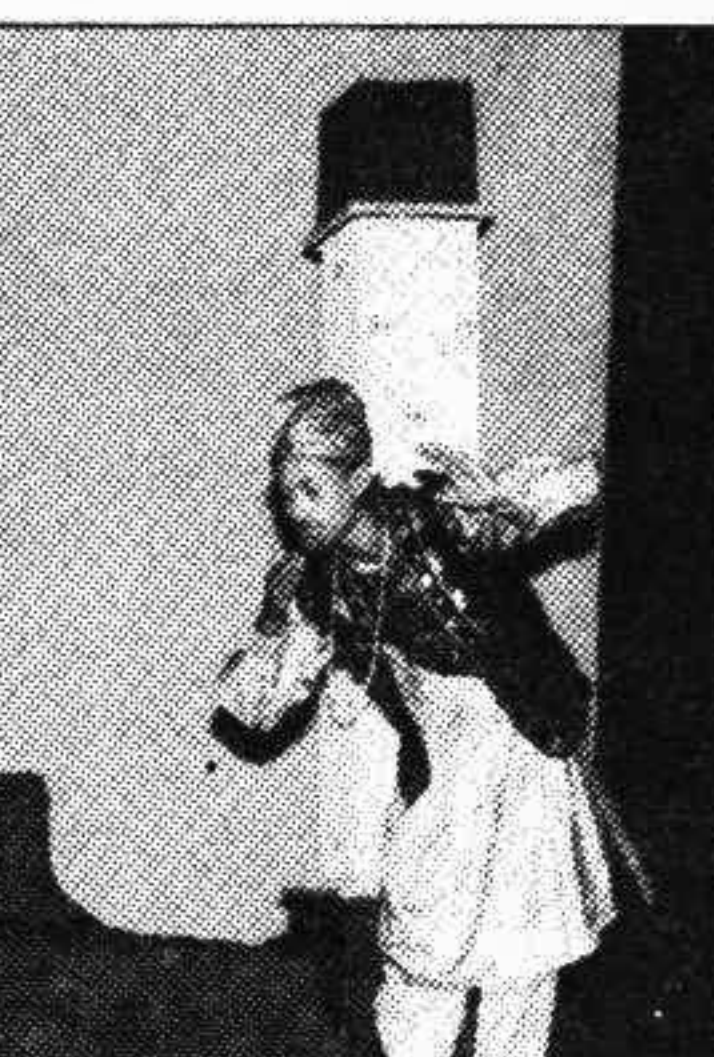
Young performers have continued to put up impressive performance at the Shishu-Kishore drama festival being held at Public Library Auditorium.