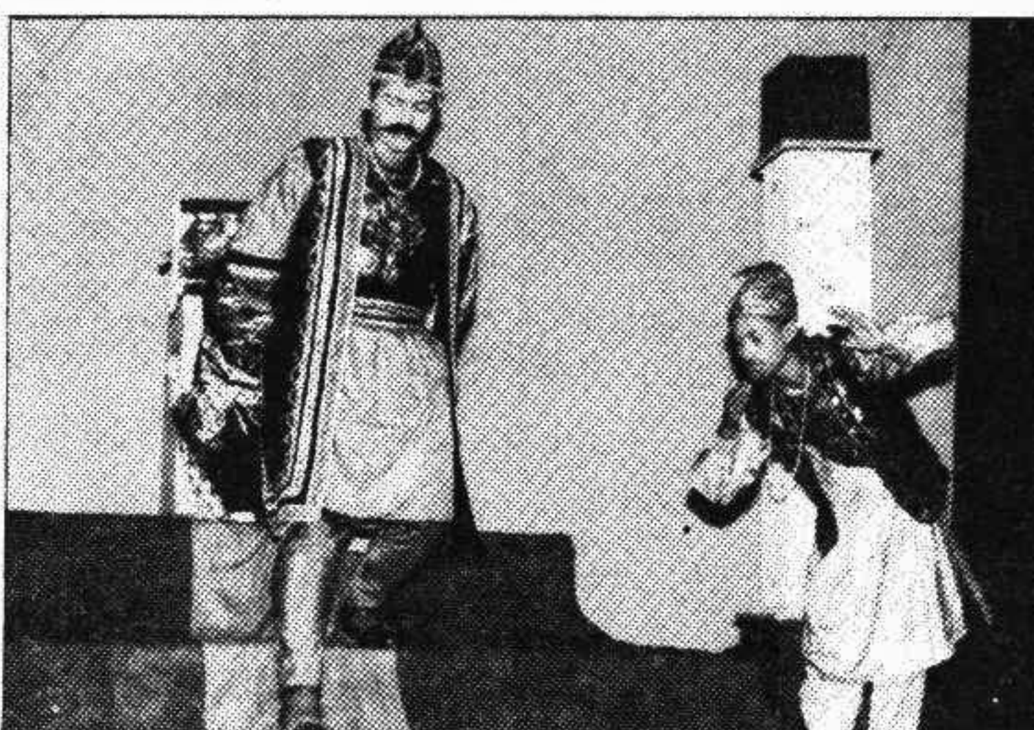
Young performers have continued to put up impressive performance at the Shishu-Kishore drama festival being held at Public Library Auditorium.

The national Shishu-Kishore theatre festival began, as in other days, at 4-30 PM in a musical atmosphere. And there gleamed before the eyes of the spectators dramatic representations of three theatre-troupes namely "Sahitya Sanskritik