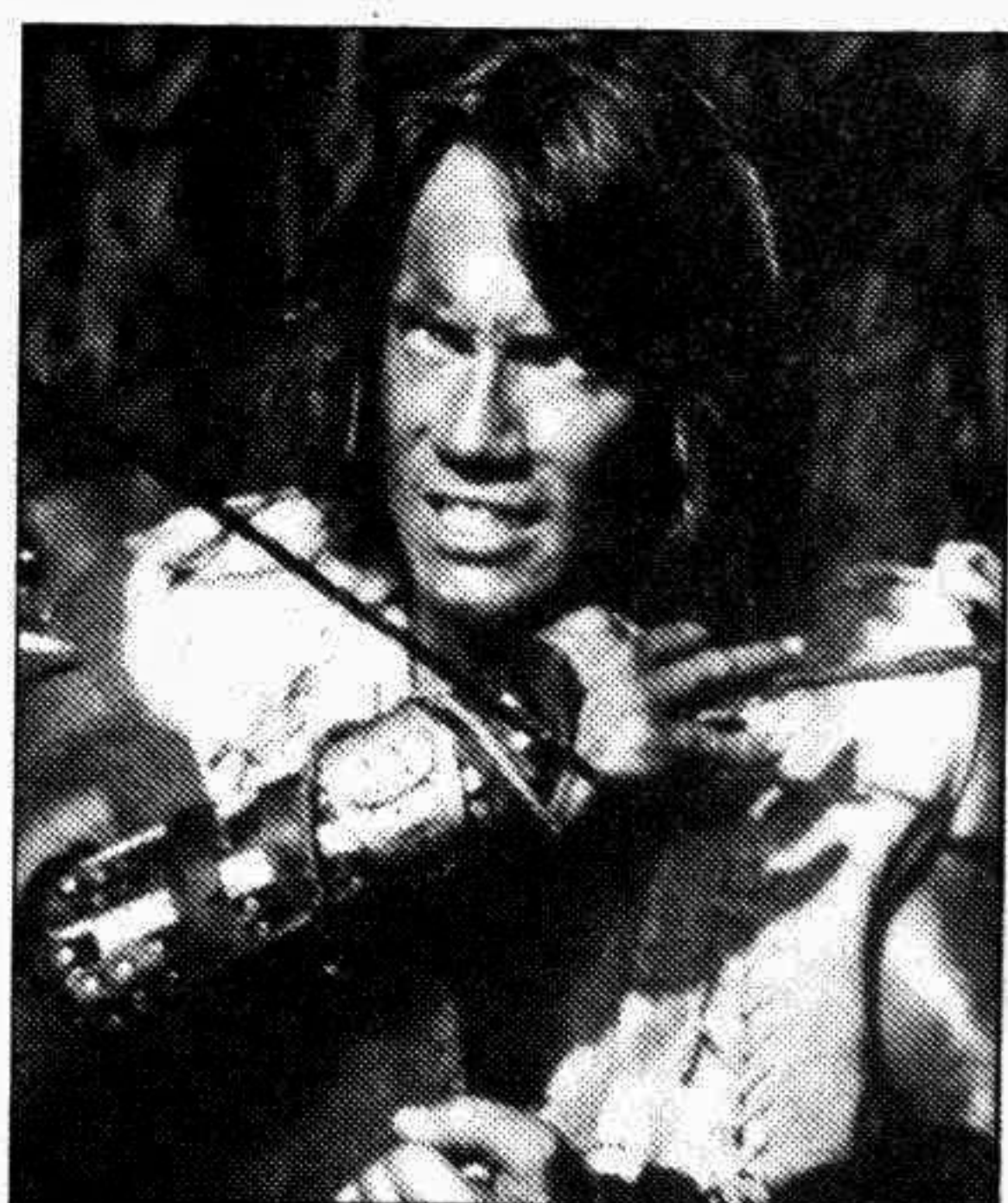
The Adventure of Sindbad on Star World at 10 pm

8:30 ATP Tour Tennis 9:00 Spanish League 1998/99 Highlights