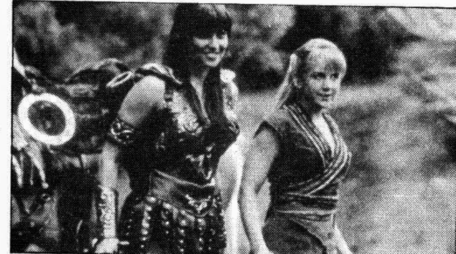
Xena: Warrior Princess on Star World at 11 pm

7:00 Crystal Maze 8:00 Mr. Belvedere 8:30 Nanny And The Professor 9:00 The Good Life 9:30 Murder Most Horrid 10:00 How Bizarre 10:30 Travel Asia 11:00