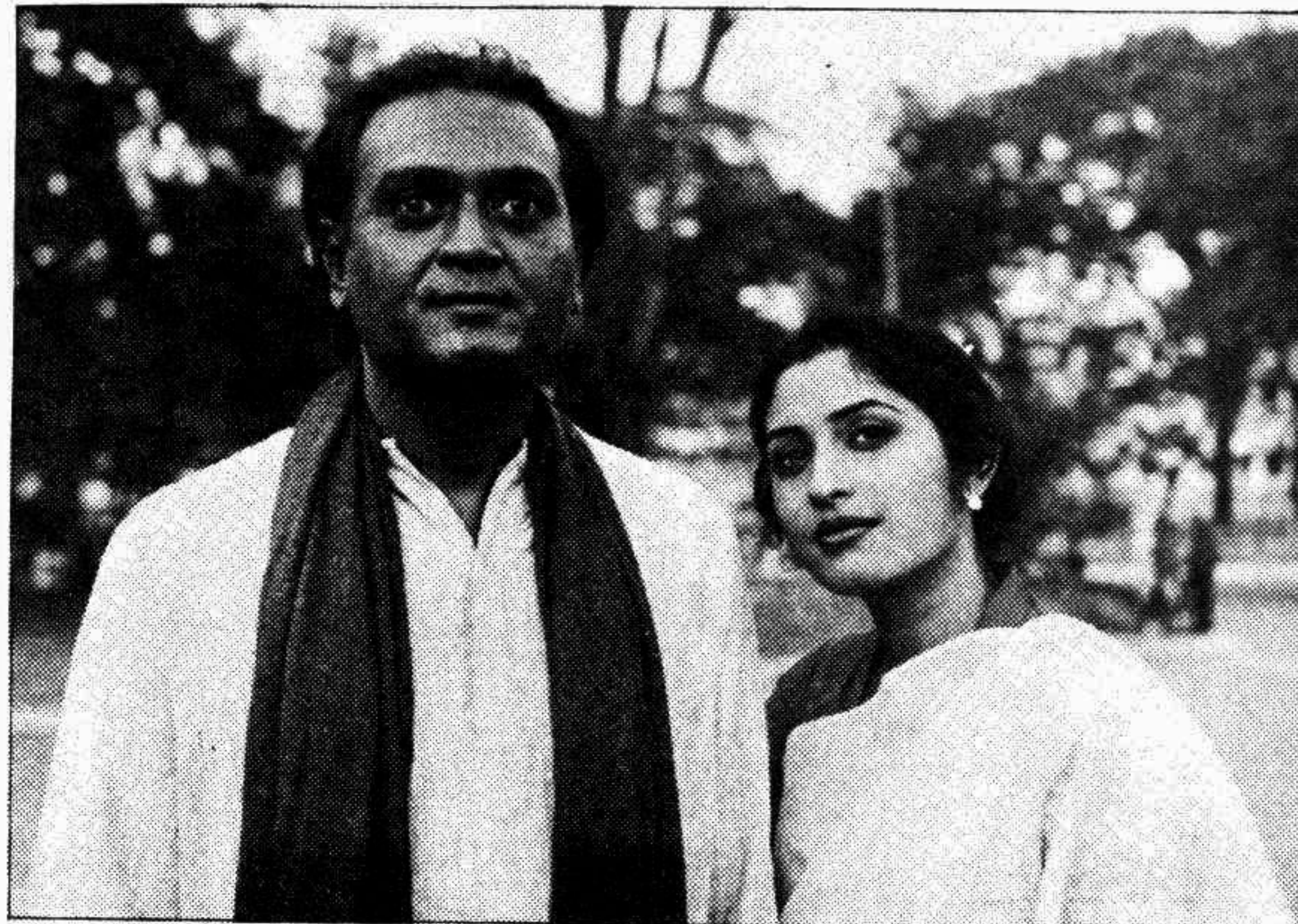
A still from Chandraloke Ognikanda

The drama begins with Ostad Riyaz Hossain entering the lobby of a house in Dhaka. As the guard takes him in, he stares at Lubna's photograph on the wall and reminisces about the first time he met her in Kurigram, when she went there to sing at a function. Soon after, Lubna comes down the stairs and greets the old gentleman with excessive zeal and earnestness and begs him to stay with them. She even wants to forgo her radio recording for the man she barely knew. She had written to him once, to which he did not reply. As Lubna mentions that, he says, "I came to answer that in person". Then this man tells her not to tell her parents about knowing him, or about meeting him in Kurigram, to which she hesitantly agrees. This seemed a little out of the ordinary since she trusted the stranger she met in Kurigram more than she trusted her parents. Anyway, even though Lubna agrees to lie