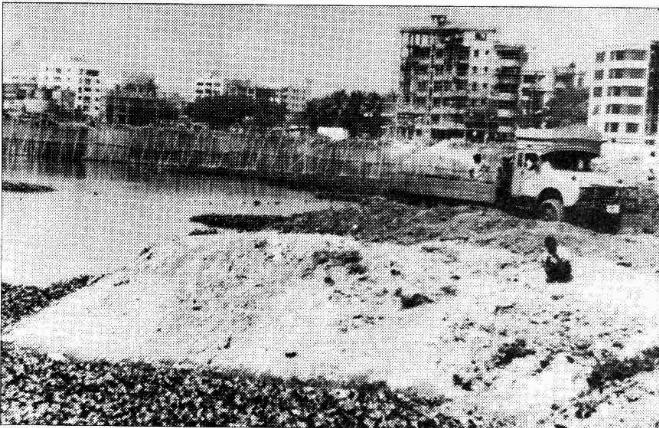
A truck is dumping earth into the Banani Lake near Road No 15.