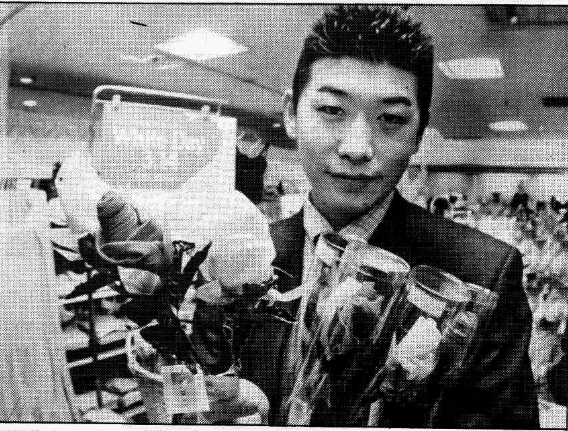
TOKYO: An employee of Ginza Printemps department store shows rose-shaped panties for "White Day" gifts Tuesday in Tokyo.