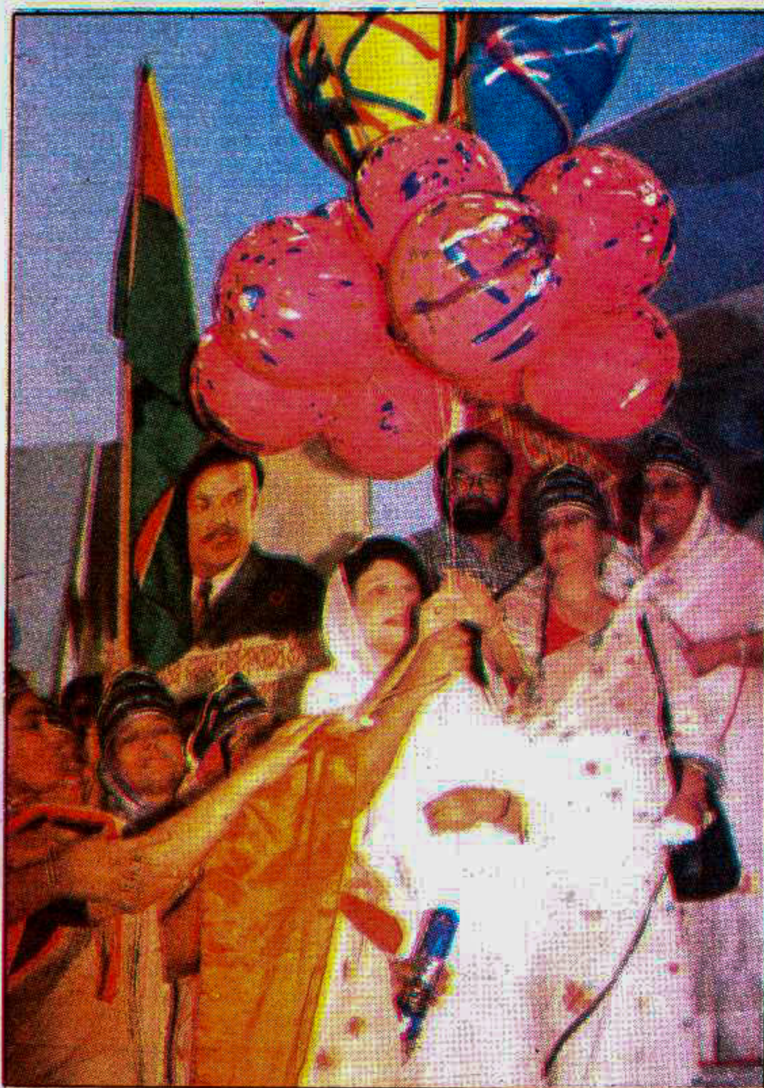
BNP Chairperson Begum Khaleda Zia inaugurated the Mahila Dal rally marking the International Women's Day by releasing balloons at Siddeswari Balurmath in the city yesterday.

Published by the Editor from City Publishing House Ltd., 90 Kakrail, Dhaka-1000 on behalf of Mediaworld C.A., Dhaka-1000. Editorial, News & Commercial Offices: House No. 11, Road No. 3, Dhanmandi RA, Dhaka-1205. PABX: 866772-4, Commercial: 866771, Fax No: 88-02-863035, GPO Box No: 3257, Cable: DAILYSTAR, DHAKA. Internet edition address: http://www.dailystarnews.com and Email address: dstar@bangla.net