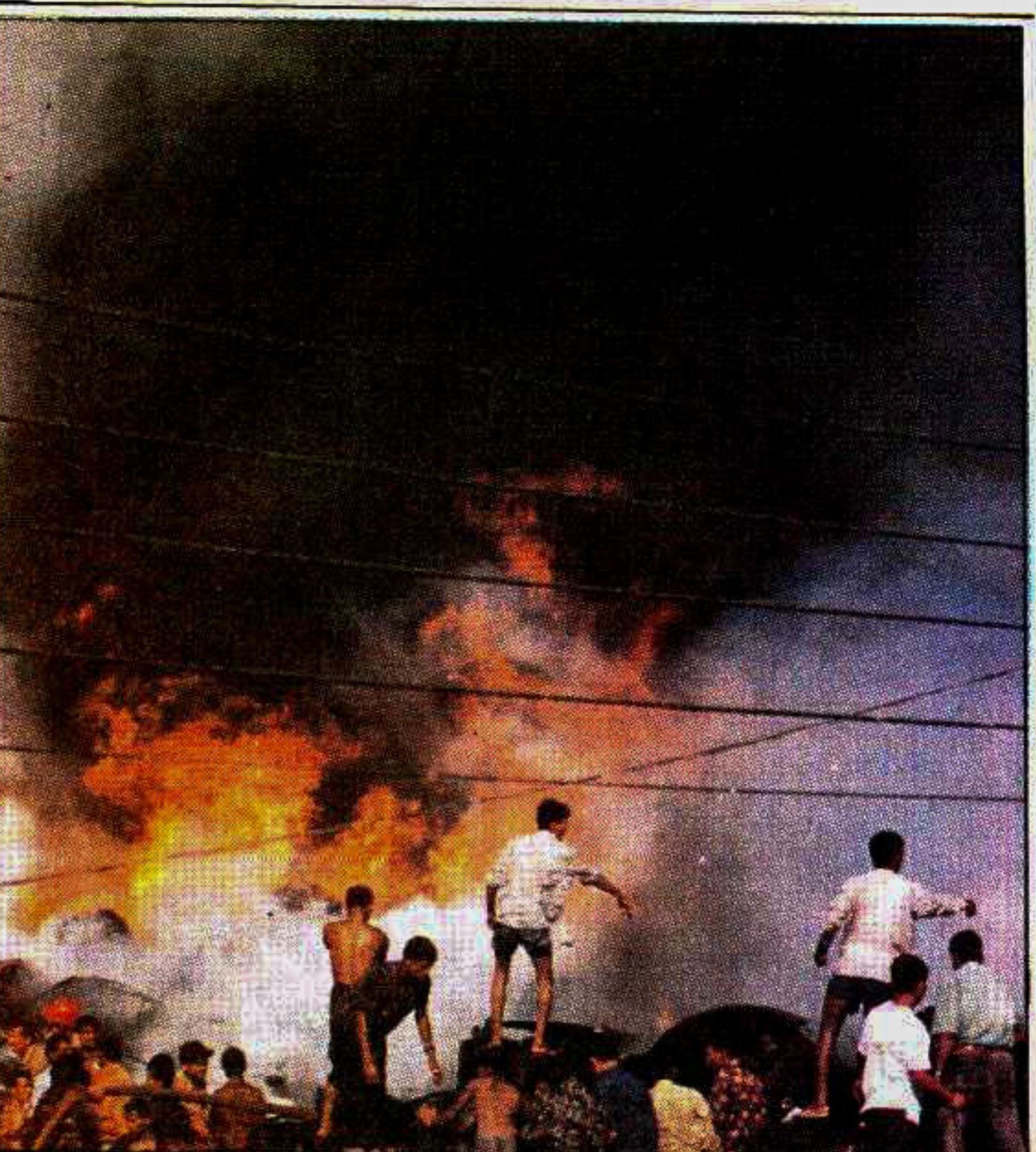
Firefighters, with the help of local people, trying to extinguish the flames at the warehouse of Bangladesh Rural Telecom Authority at Gulshan in the city yesterday.