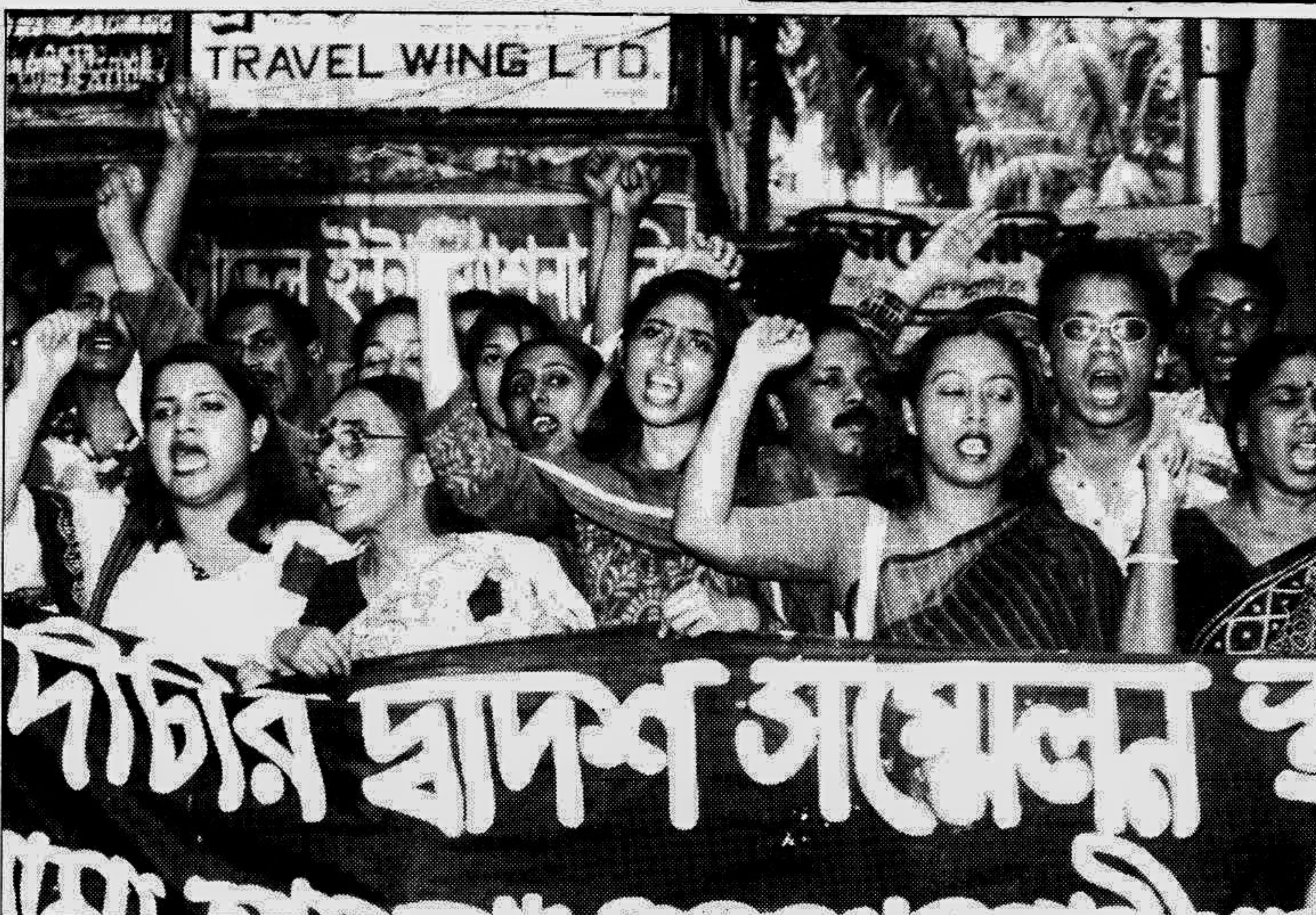
Udichi artistes brought out a rally in the city yesterday protesting the killings in Jessore and demanded the arrest of persons responsible for the incident.

His qulkhwan will be held at his residence at 19/5, 10-B, Mirpur in the city on March 12 after Juma prayers.