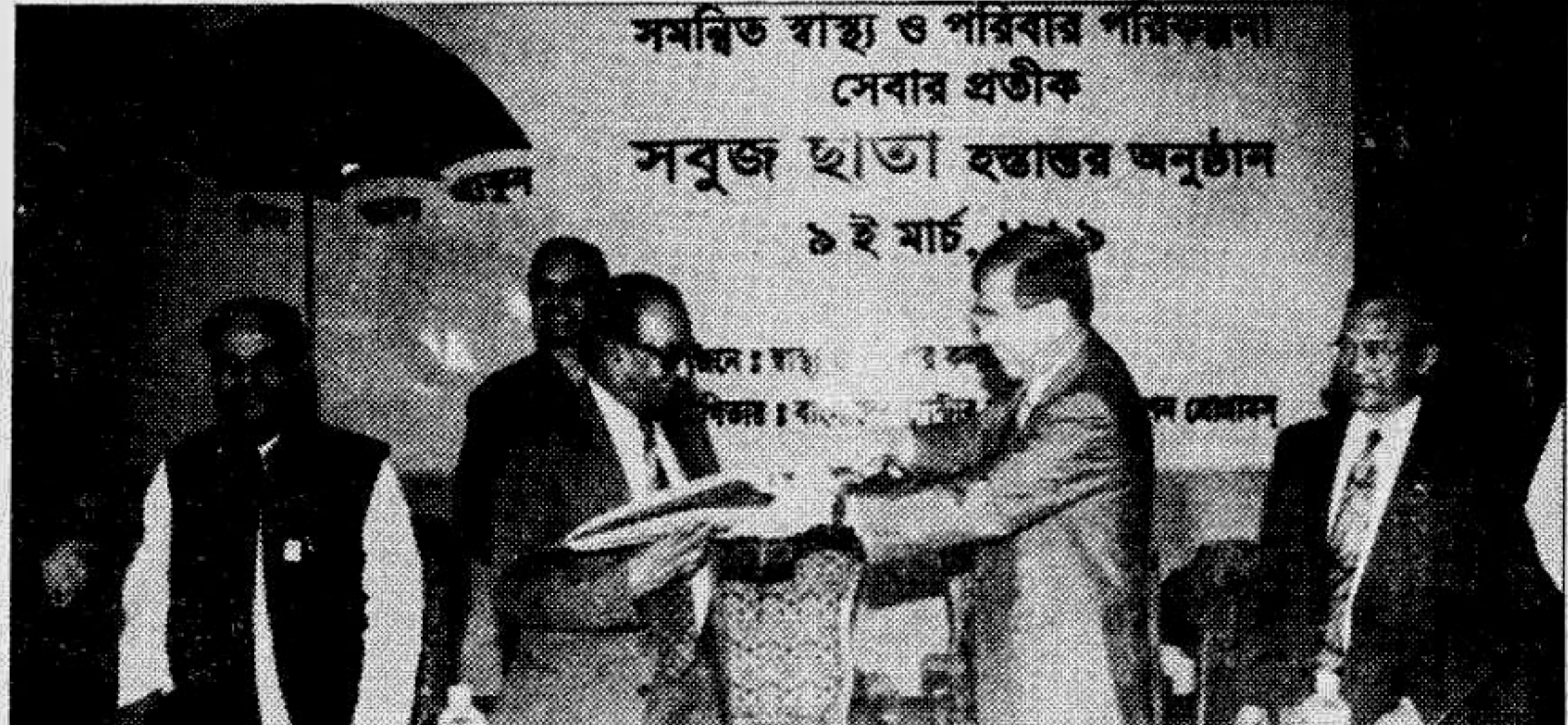
Japanese Ambassador to Bangladesh Yashikazu Kaneko handing over green umbrella for distribution among the field workers to Health and Family Welfare Minister Salahuddin Yusuf yesterday in the city.

Eleven stalls of different attractive agricultural products were set up in the fair.