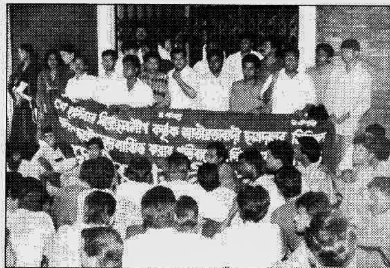
Jatiyatabadi Chhatra Dal held a rally in front of the VC's office on the Dhaka university campus yesterday protesting the attack on its Sunday's procession.