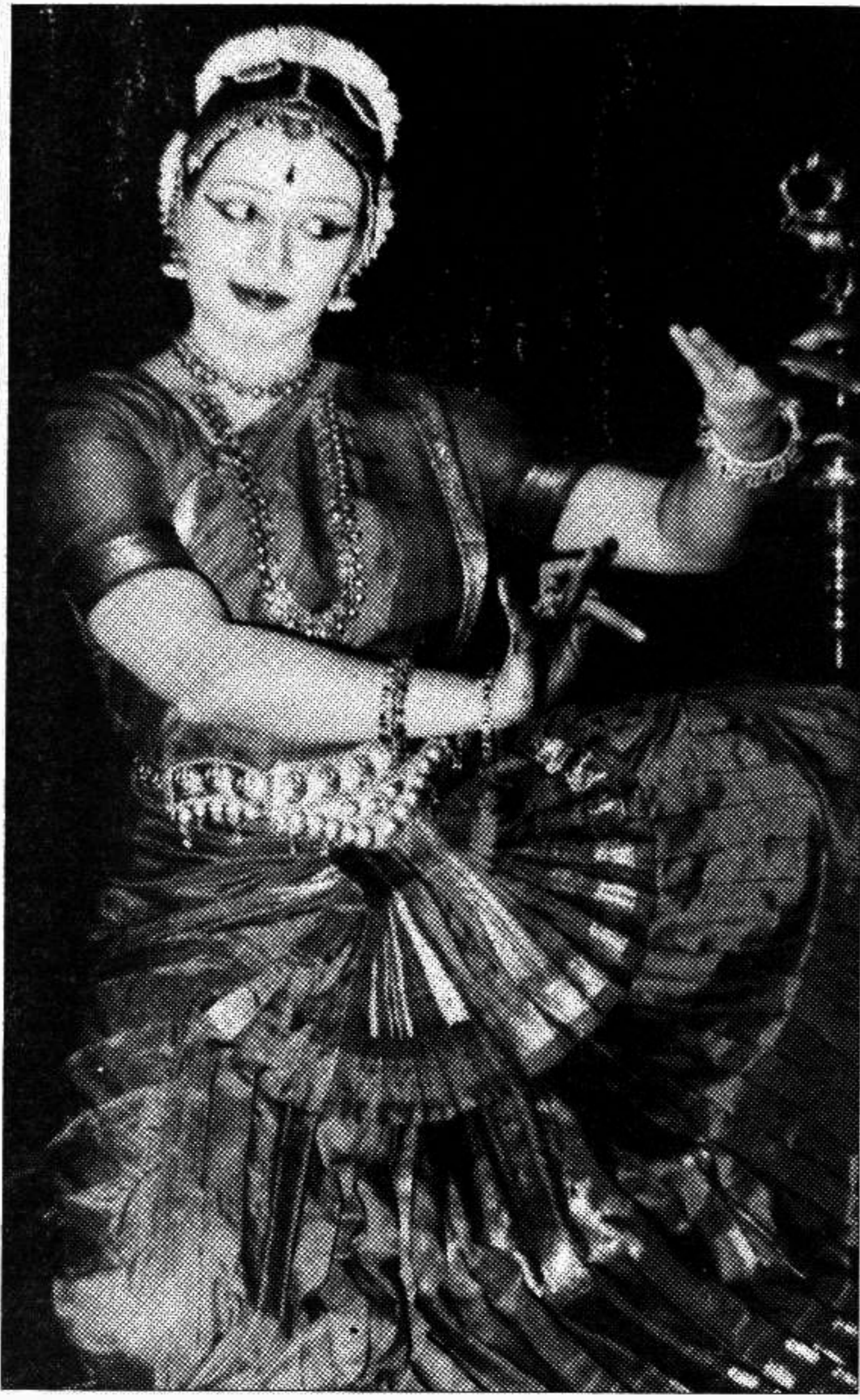
Pratihba mixes her sense of modernity eloquently with tradition.