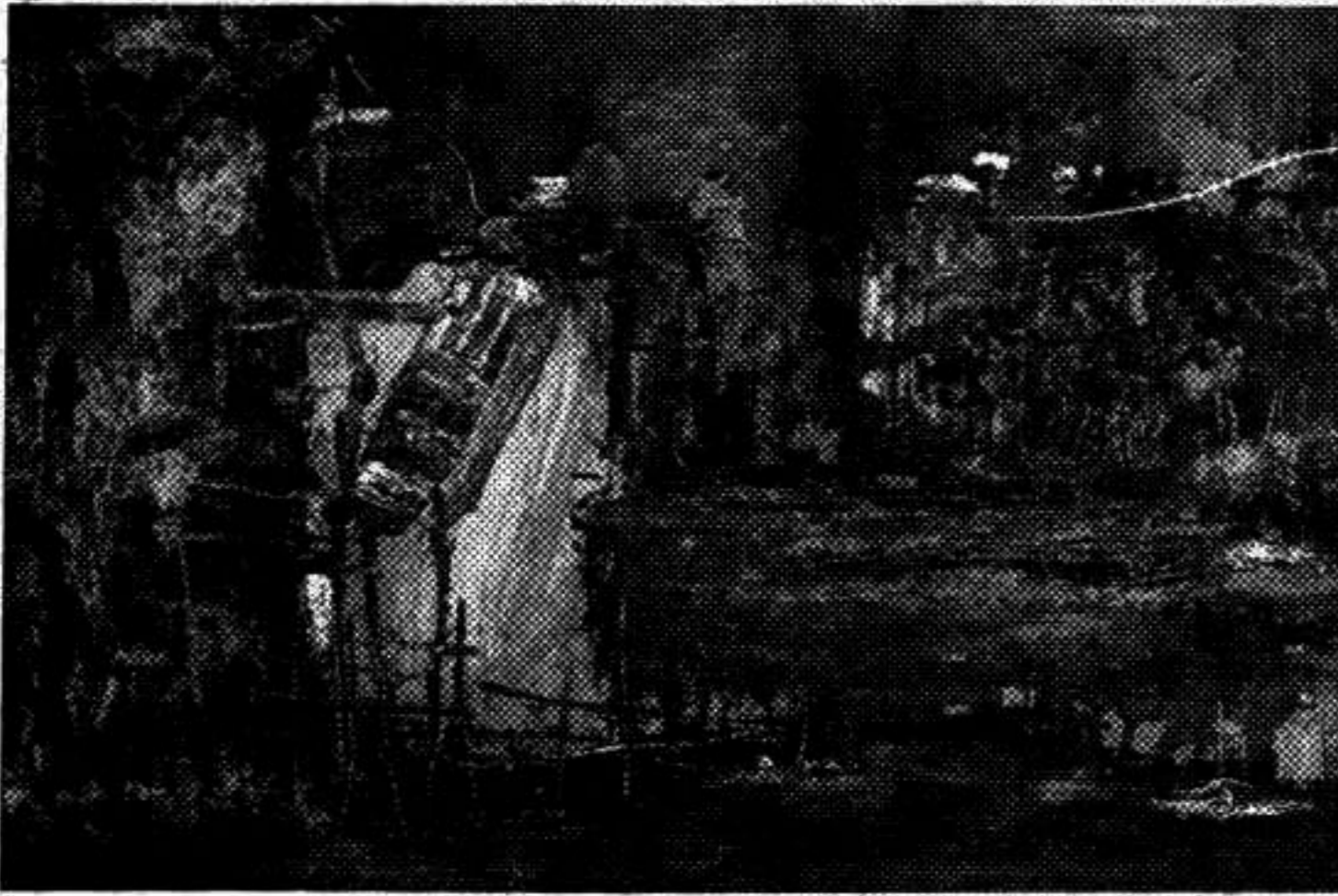
Autumn Ray-5 Oil on Paper