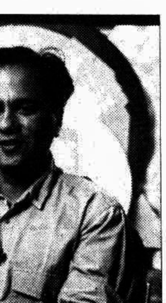
Out of India

10:30 Janmadin (Birthday Greetings) 10:30 Gane Gane 10:35 Daily Sope: Shree Ram Krishna 11:00 Daily Sope: Dropadi 11:15 Classical/Folk Songs 11:30 Parliament Hour/Musical 12:30 Daily Sope: Singha Bahini/Guptbari 1:00 Daily Sope: Asha 1:30 Daily Sope: Rupkatha 2:00 Daily Sope: Kanakanjali 2:30 Daily Sope: Shree Ram Krishna 3:00 Daily Sope: Maha Prabhu 3:30 Daily Sope: Bhangagar Khela 4:20 Nepal Prog 5:05 Modern Songs/Employment News/Lalikaala 5:30 News 5:40 Employment News 5:50 Sushastha 6:10 Faska Gero 6:40 Khas Khabar 6:50 Daily Sope: Jannabhumi 7:30 Bangla Sambad 7:55 Dinindan 8:00 Manasi 8:30 Amader Katha 9:00 Daily Sope: Jannabhumi 9:30 Daily Sope: Dropadi 10:00 Khas Khabar 10:10 Bengali Movie