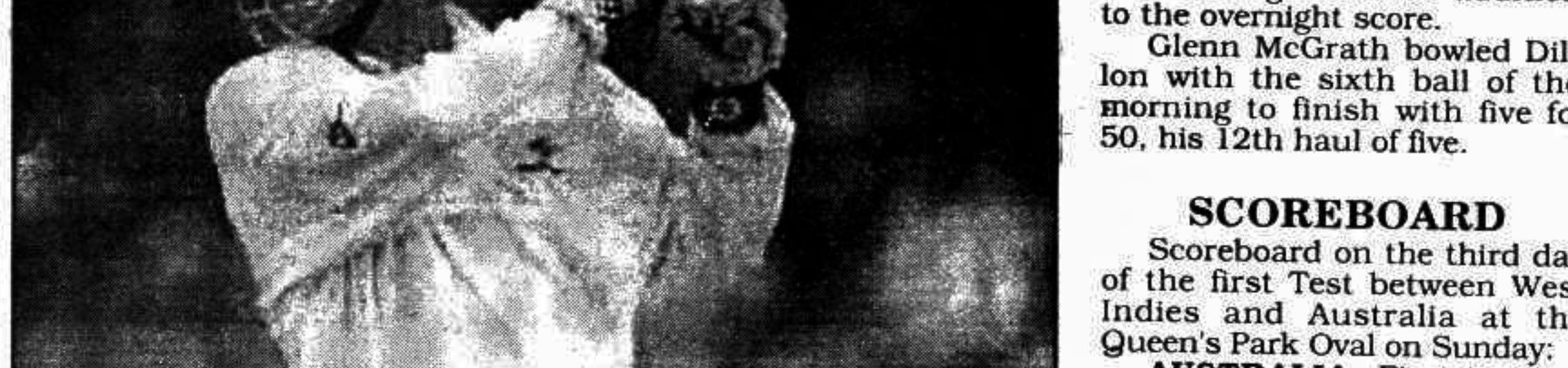
Australian opener Michael Slater follows through on a pull shot on the third day of the first Test in Trinidad on March 7.

Slater followed through on a pull shot on the third day of the first Test in Trinidad on March 7.