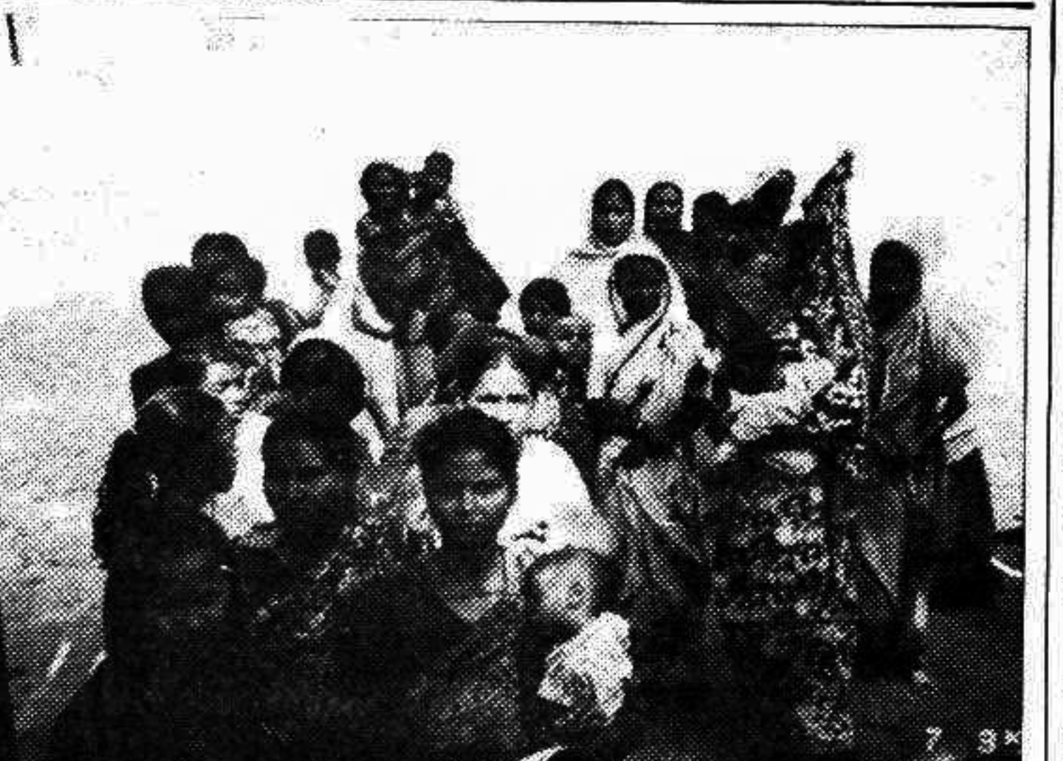
Platform to Resist Violence Against Women in association with Manobik Shahajiya Sangstha organised relief distribution programme yesterday among the female victims of the recent fire at the Agargaon slum as part of their International Women's Day programme. Leading organisations at the country participated in the programme.