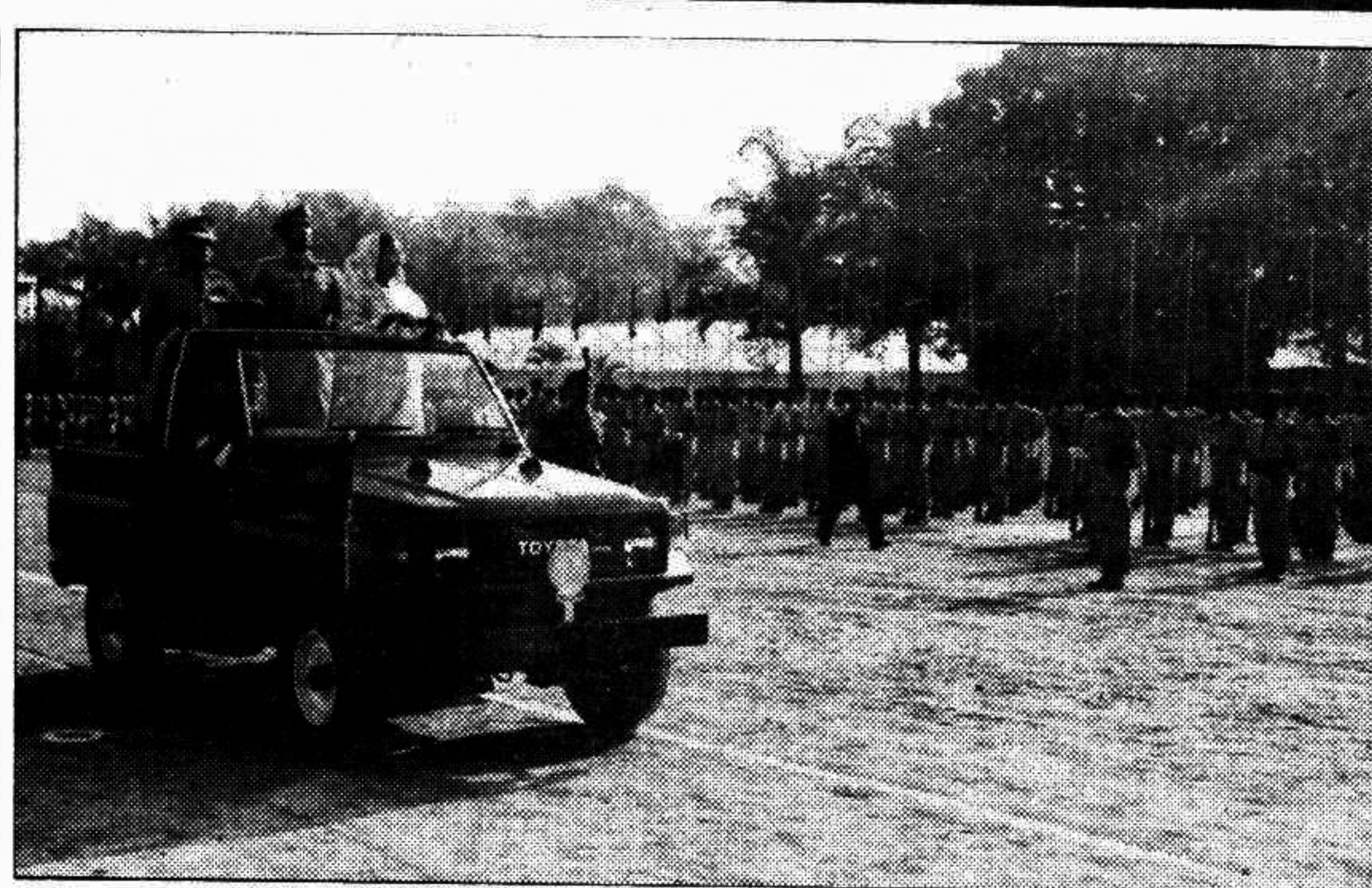
Prime Minister Sheikh Hasina inspecting guard of honour at the Annual Police Rally '99 at Razarbagh in the city yesterday.