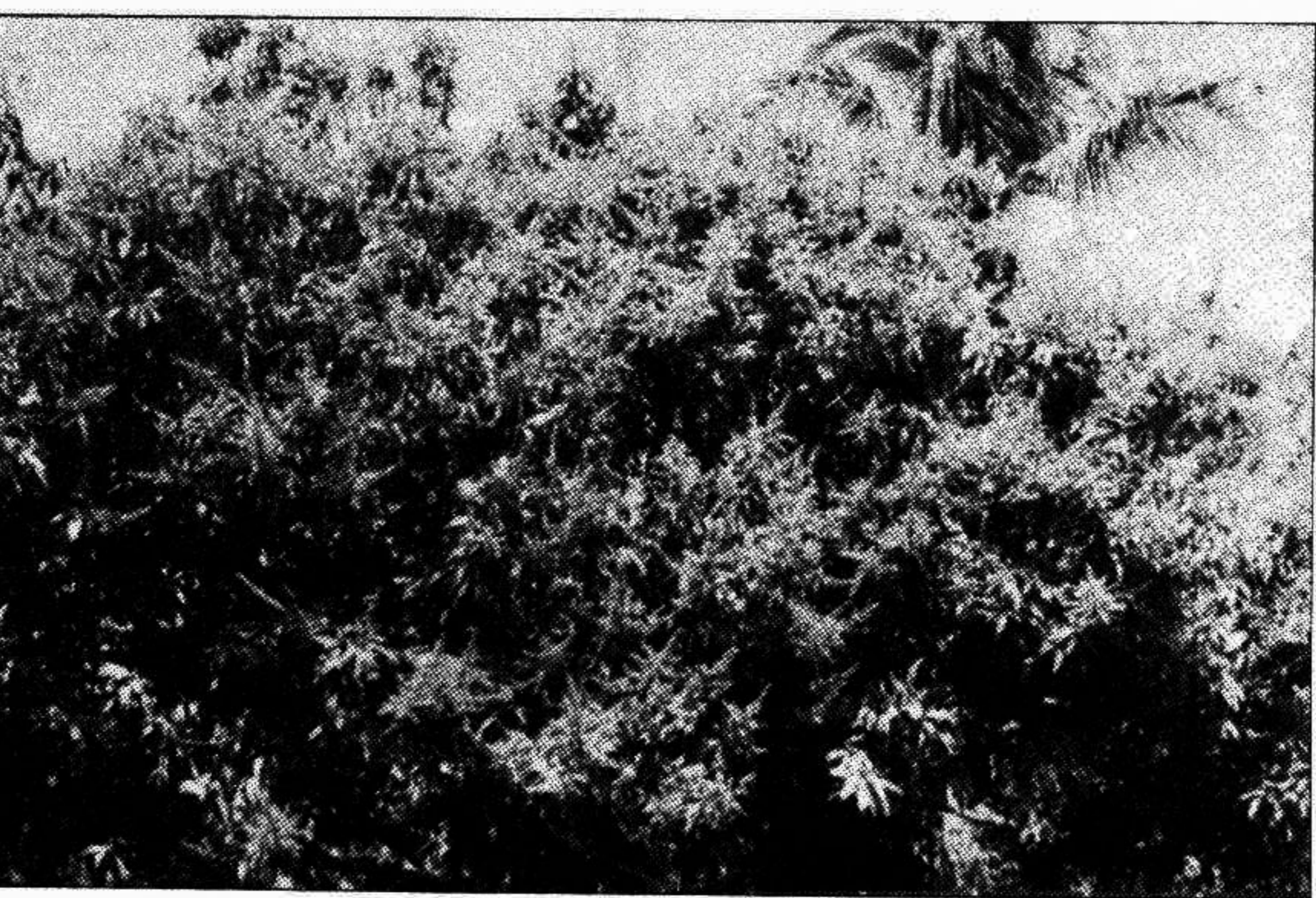
JHENIDAH: Mango sprouts in full bloom at Saikupa here.