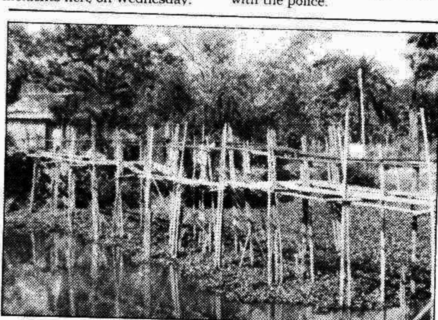
GOPALGANJ: The southern part of the district town has remained disconnected with city centre due to absence of a pucca bridge. Hundreds of people cross a temporary built bamboo bridge every day risking their lives on Gopalganj-Pathalia road.

Three posts of ward boys of 13 posts of health assistants are also lying vacant. There is no doctor in the emergency department. Patients needing immediate treatment have to be looked after by the resident doctor. There is further allegation that water for the patients, doctors and workers has to be brought from outside. Sinking of a tubewell in the hospital premises has therefore become essential. The hospital building is in a decrepit condition due to lack of proper maintenance. The operation theatre, delivery room and wards are in a shabby condition. The plaster has peeled off and the roofs of most of the rooms leak profusely whenever rain falls.