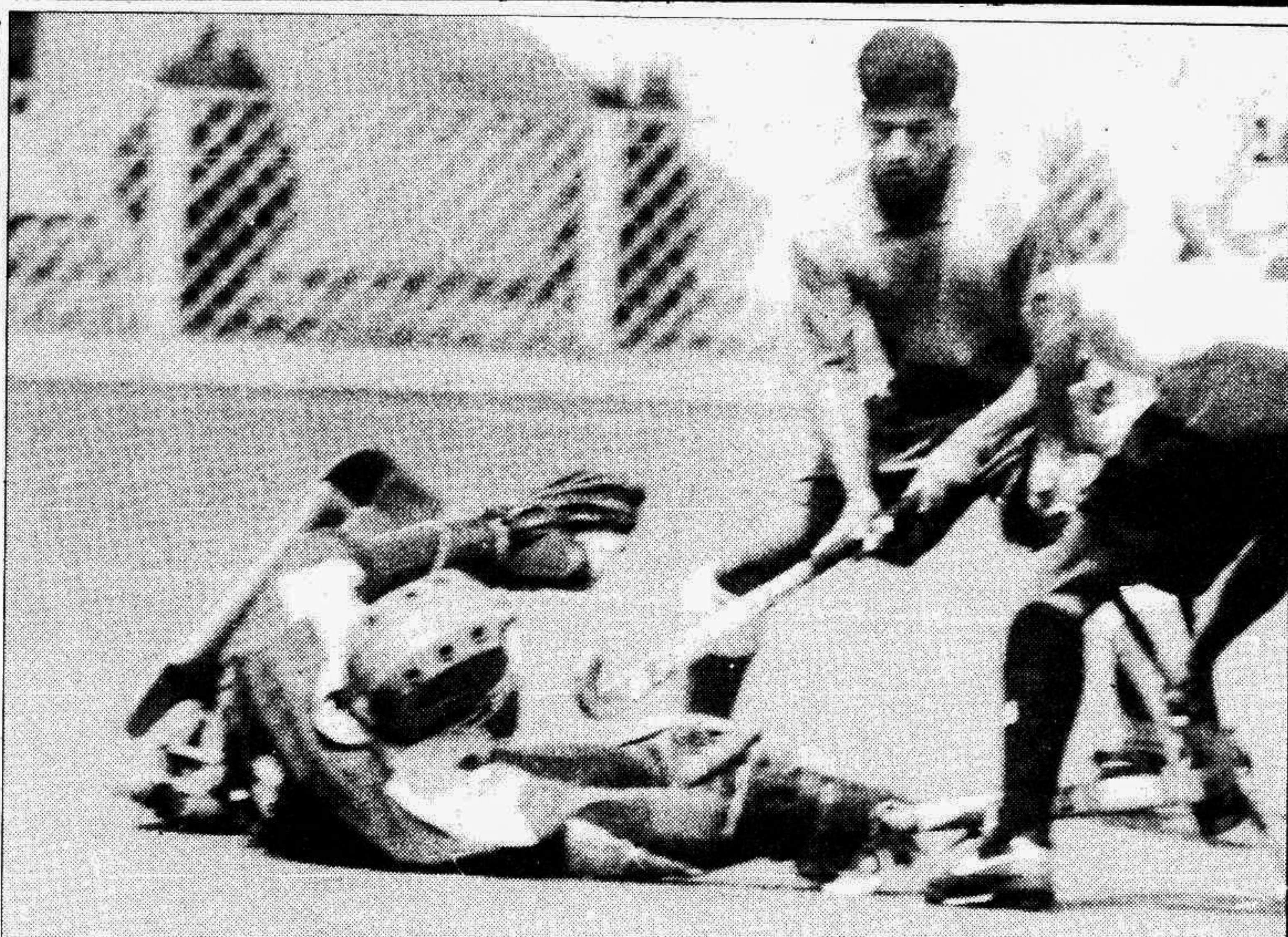
Action from yesterday's Green Delta Premier Division hockey league match between Mohammedan Sporting and Azad Sporting at the Moulana Bhasani Stadium.