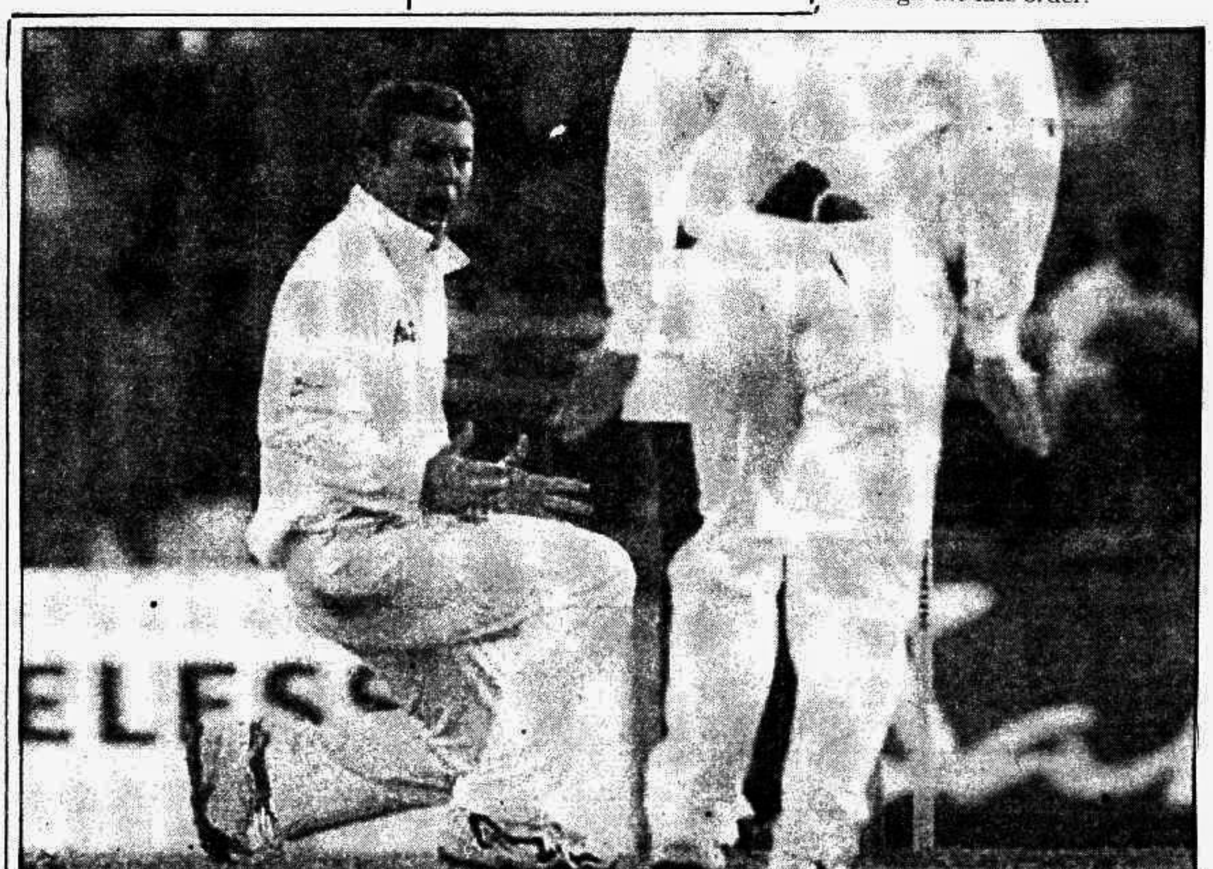
Australian leg-spinner Stuart MacGill exults after having Roland Holder lbw during the second day's play of the first Test at Port of Spain on March 6.