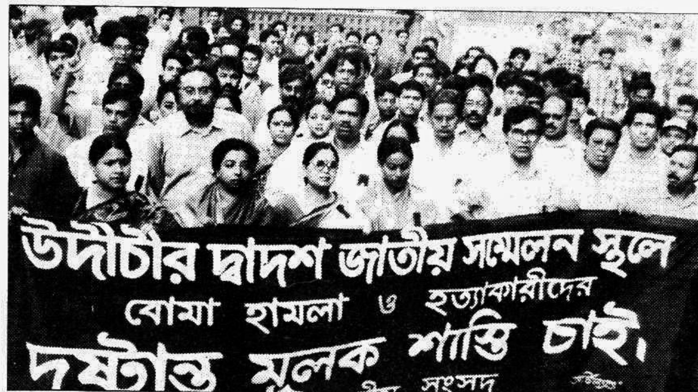
Cultural activists bring out a protest procession, under the Udichi Kendriya Shangshad banner, demanding exemplary punishment for the killers of eight people at the 12th National Udichi festival in Jessore.