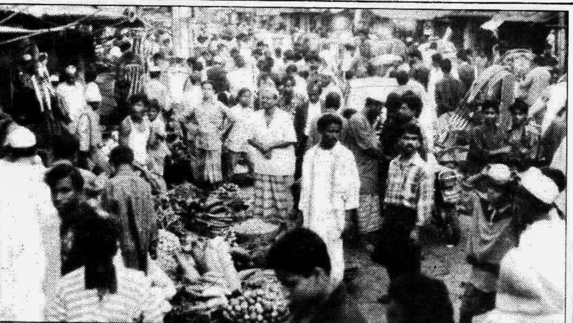
SYLHET: Most of the footpaths, even part of the main roads in busy areas of the town are occupied by vendors, causing serious traffic jams. This photo was taken from Bandar Bazar area which is the central part of the town.

Separate cases were lodged with the respective thanas.