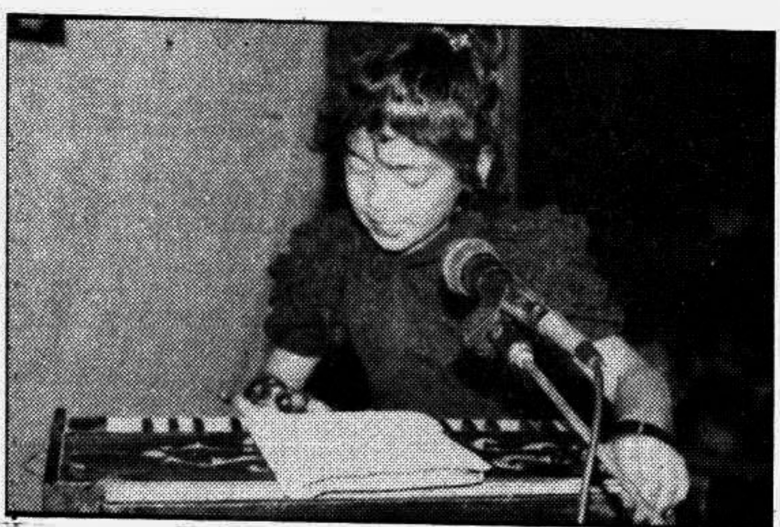
JHENIDAH: A child artist rendering songs on the occasion of Ekushey February at a function held at Saikupa Shilpakala Academy.