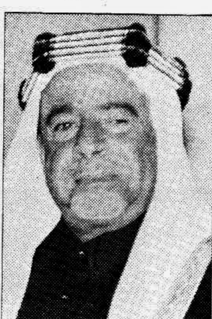
File photo of Sheikh Isa bin Salman Al Khalifa, the late Emir of Bahrain.

Cars carrying dignitaries streamed into Riffa, where sobbing men and women scattered flowers on the streets in a traditional Islamic funeral custom. About 10,000 people attended the burial, which lasted