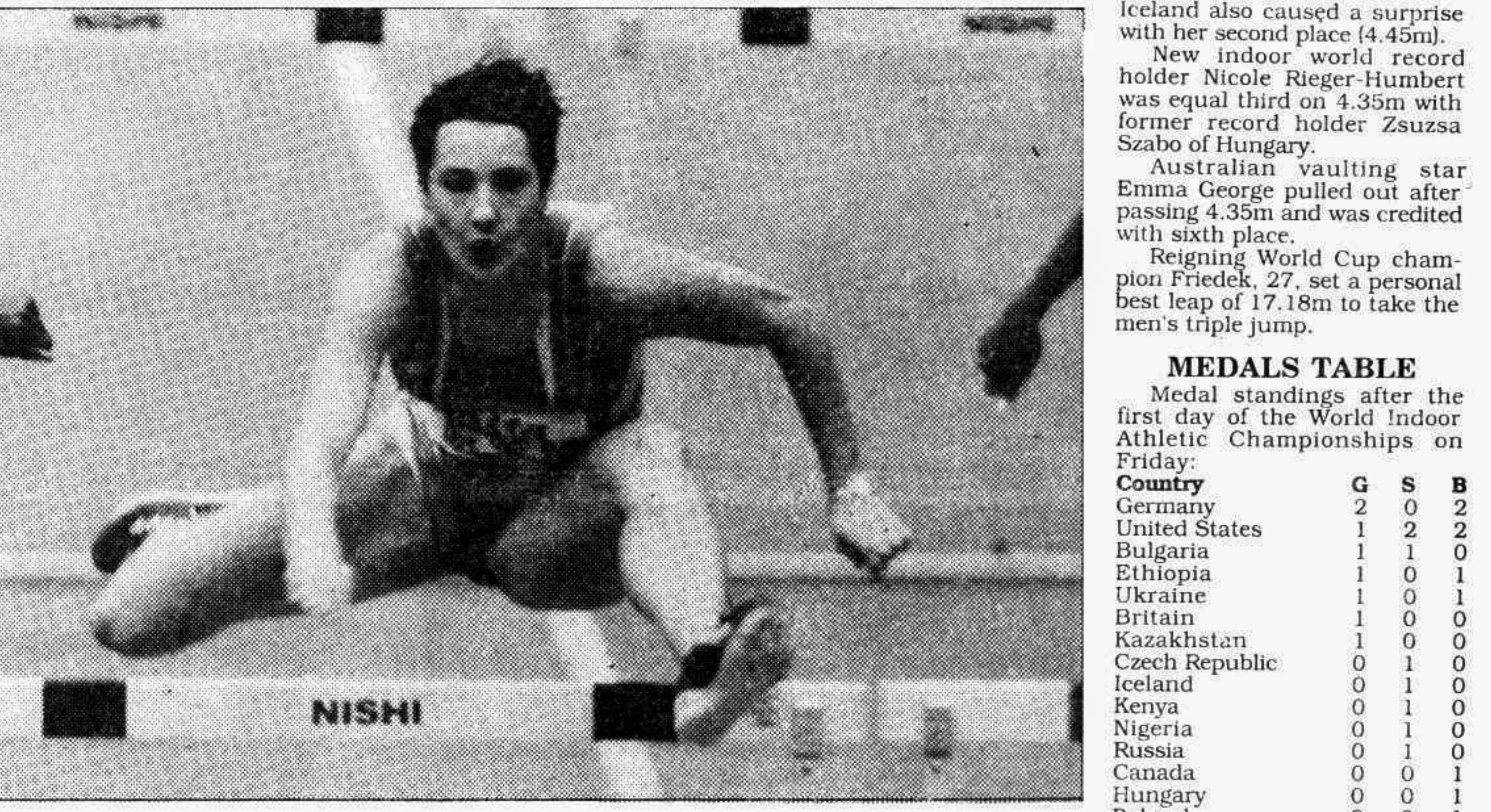
Kazakh Olga Shishigina on her way to the gold medal in the 60-metre hurdles of the World Indoor Athletics Championships.

Next, he plays one of the oldest men still in the singles game, 39-year-old Mark Woodforde. The Aussie advanced with a 6-3, 3-6, 6-1 win over Spain's Francisco Clavet, aged 30.