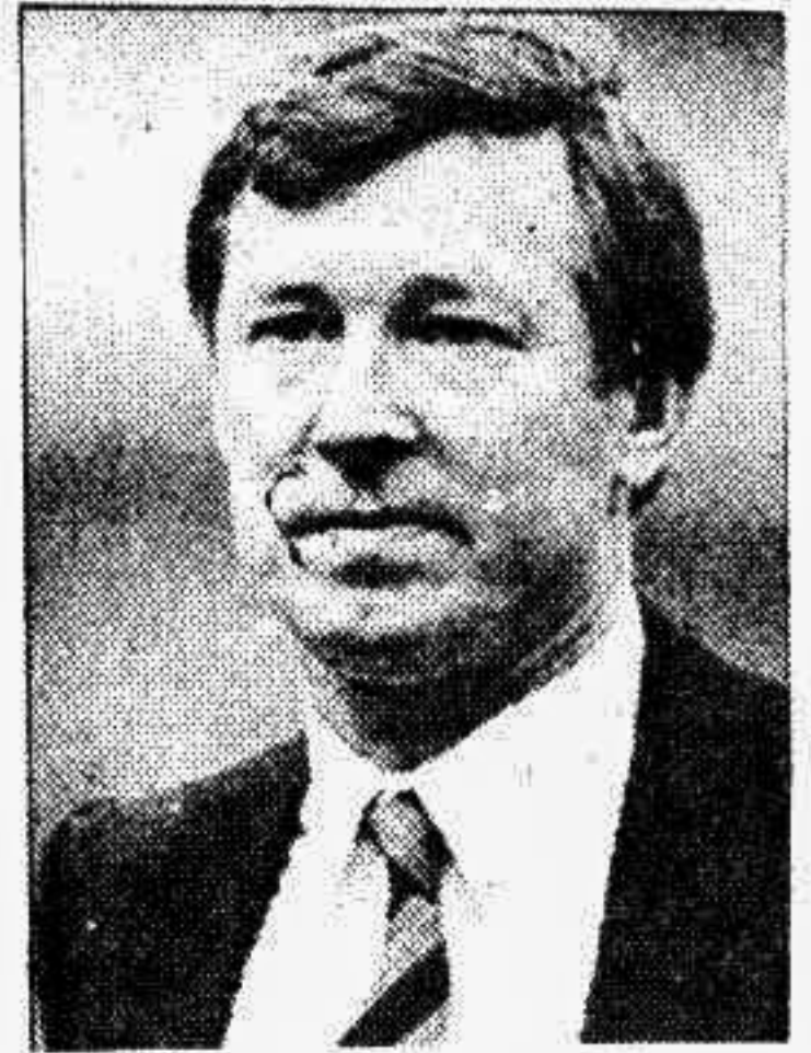
ALEX FERGUSON Ferguson believes the key to Vialli's success is the way he has studied the game during a long career in Italy and England. Vialli, capped 59 times by

to Chelsea. They've had good players and decent, entertaining teams over the years but Vialli has now got them playing in a very consistent vein of form.