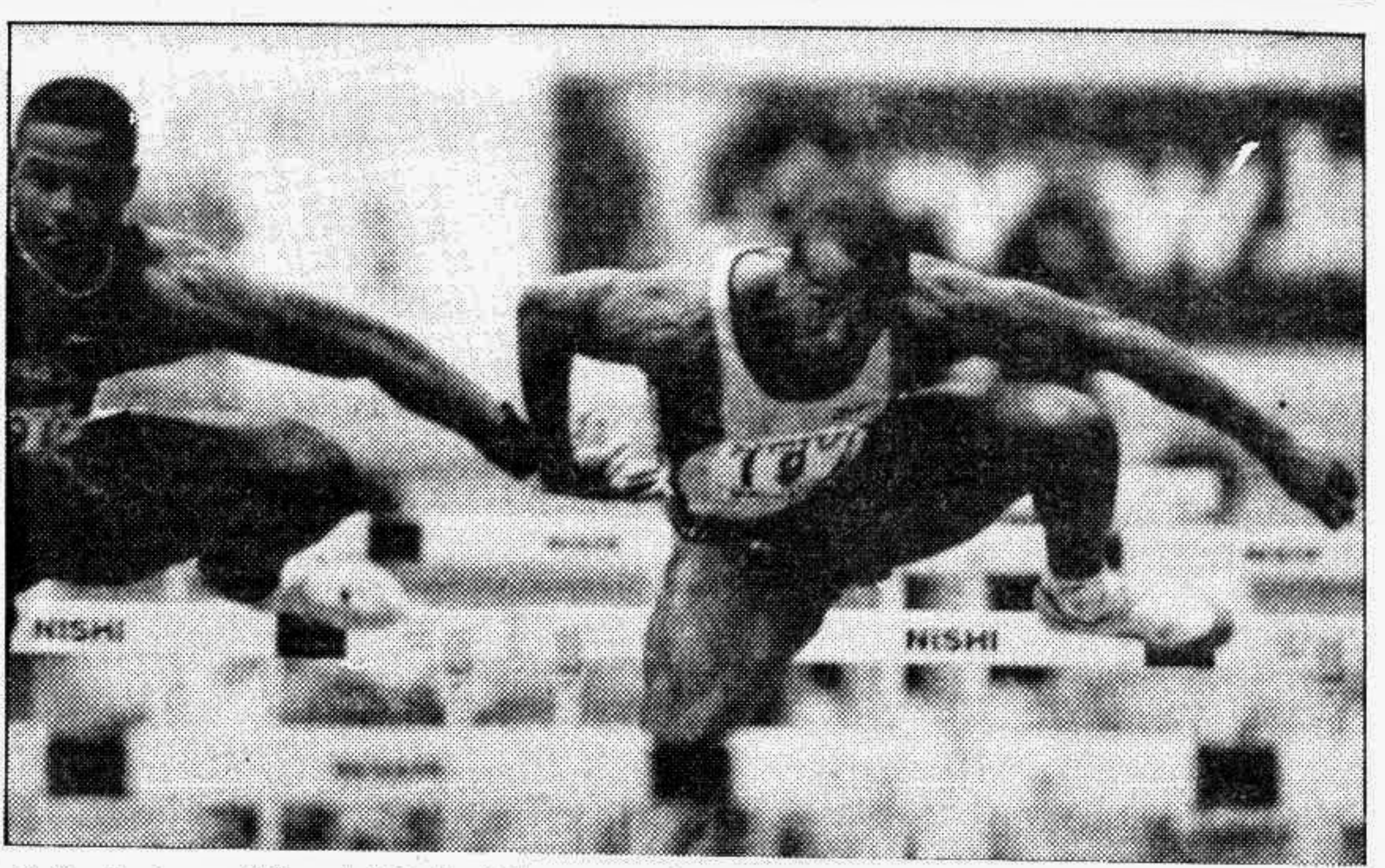
Colin Jackson of Great Britain (R) crosses the last hurdle to clinch gold in 60-metre at the World Indoor Athletics Championships in Maebashi, Japan yesterday. He took 7.38 seconds.