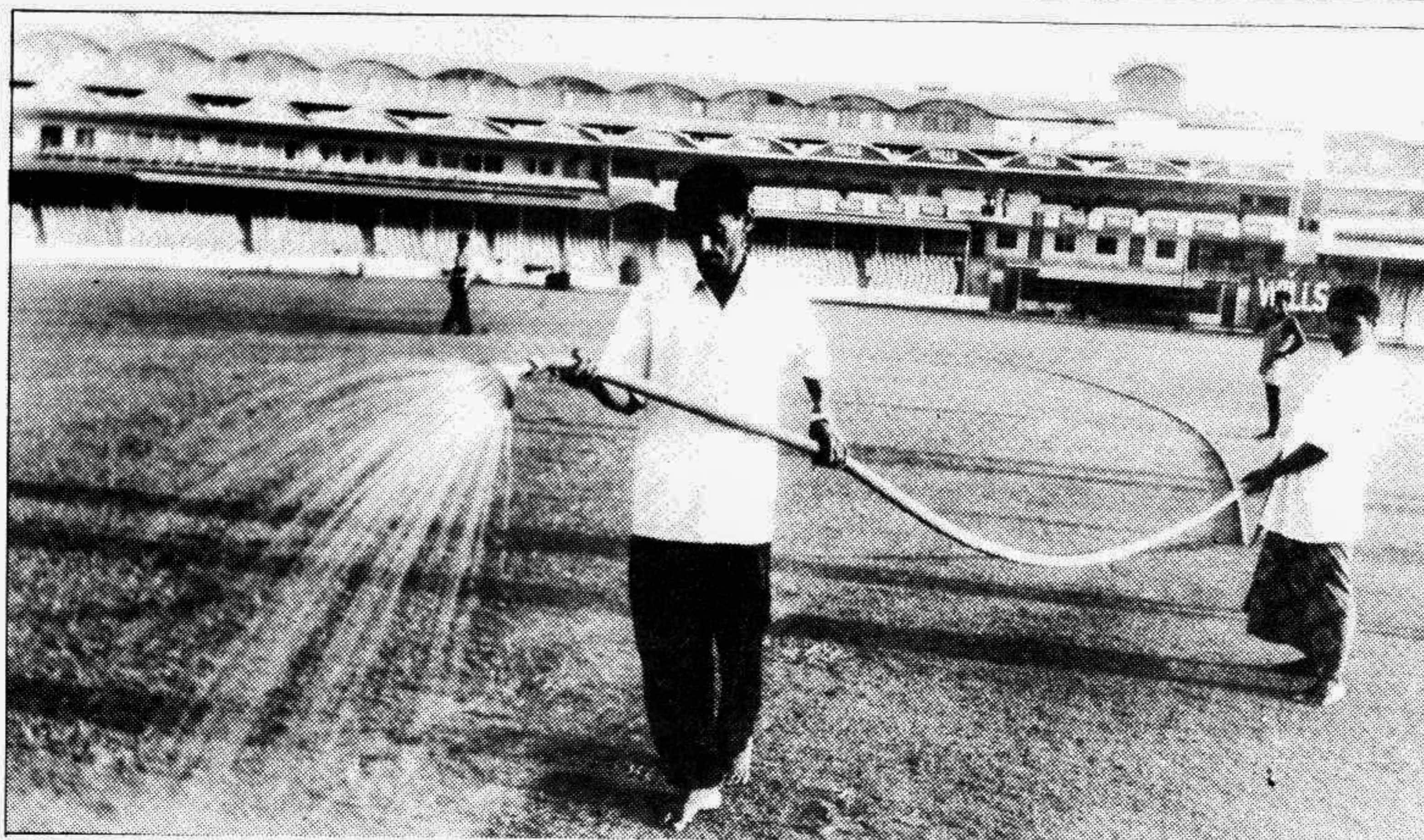
The Bangabandhu National Stadium is preparing for the upcoming final of the Asian Test Championship and the tri-nation cricket tournament. The ATC final is scheduled for 12-16 March while the limited-overs tri-series will be held from 19 to 27 of this month.