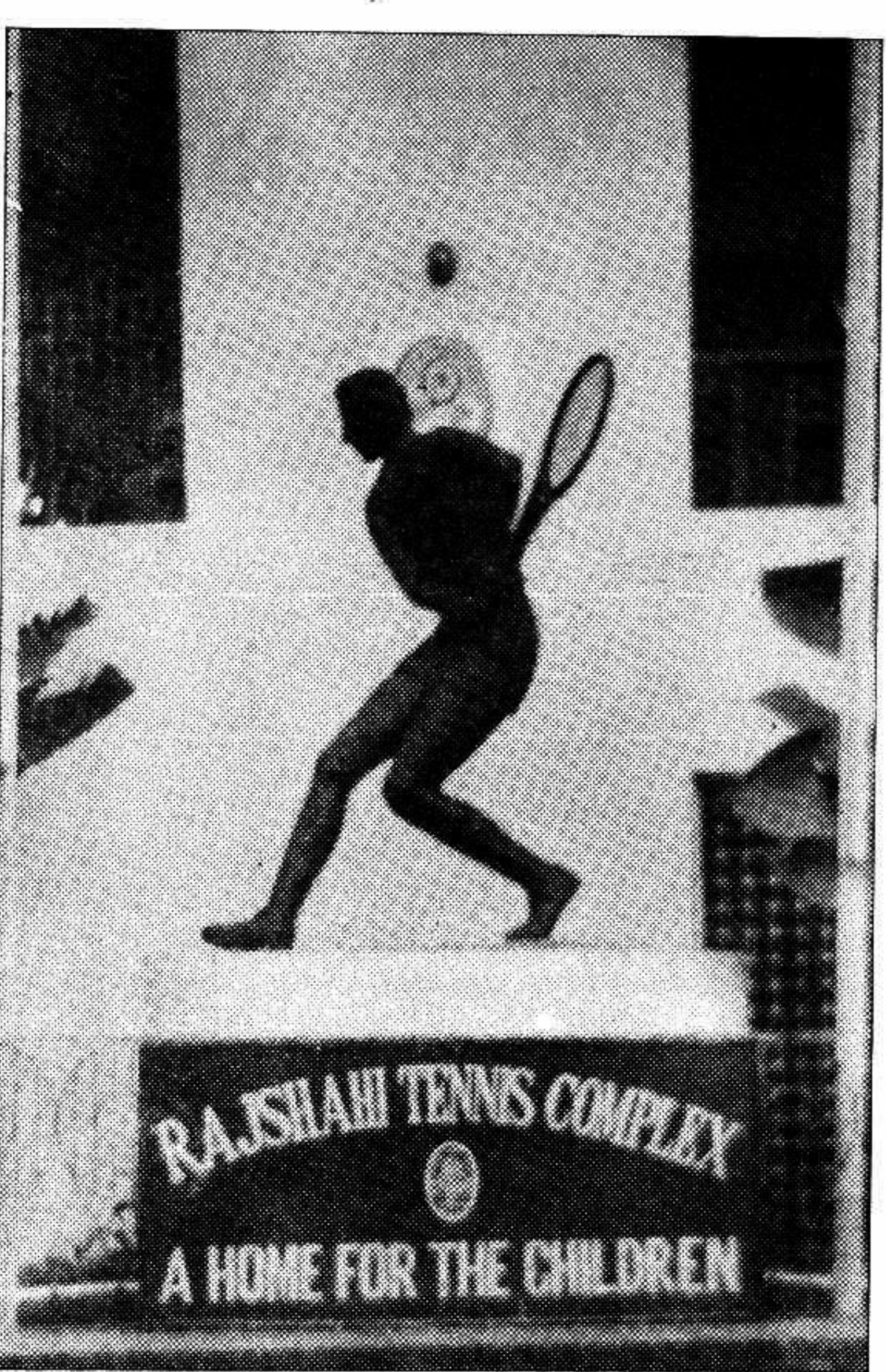
Entrance to the complex.