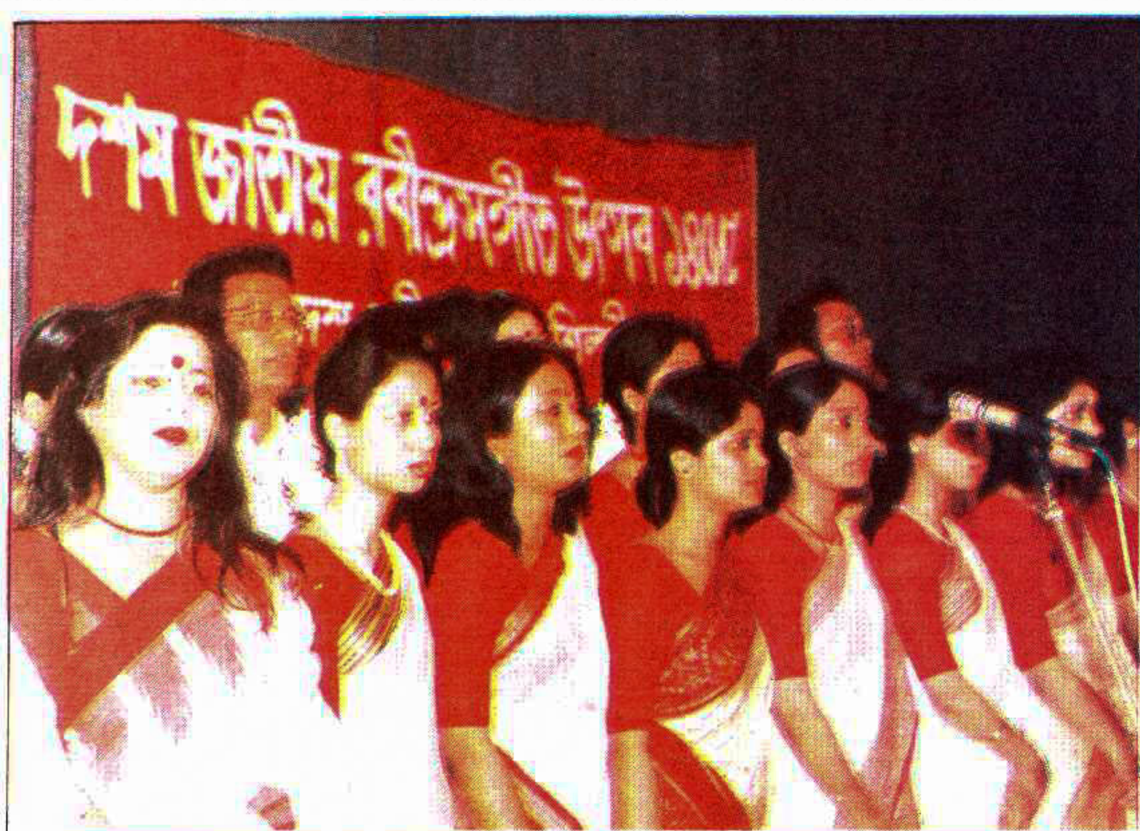
Singing Tagore, living Tagore

Artists render a Tagore song at the inaugural ceremony of the 10th National Rabindra Sangeet Festival at the Shishu Academy auditorium yesterday. The festival ends on Saturday.