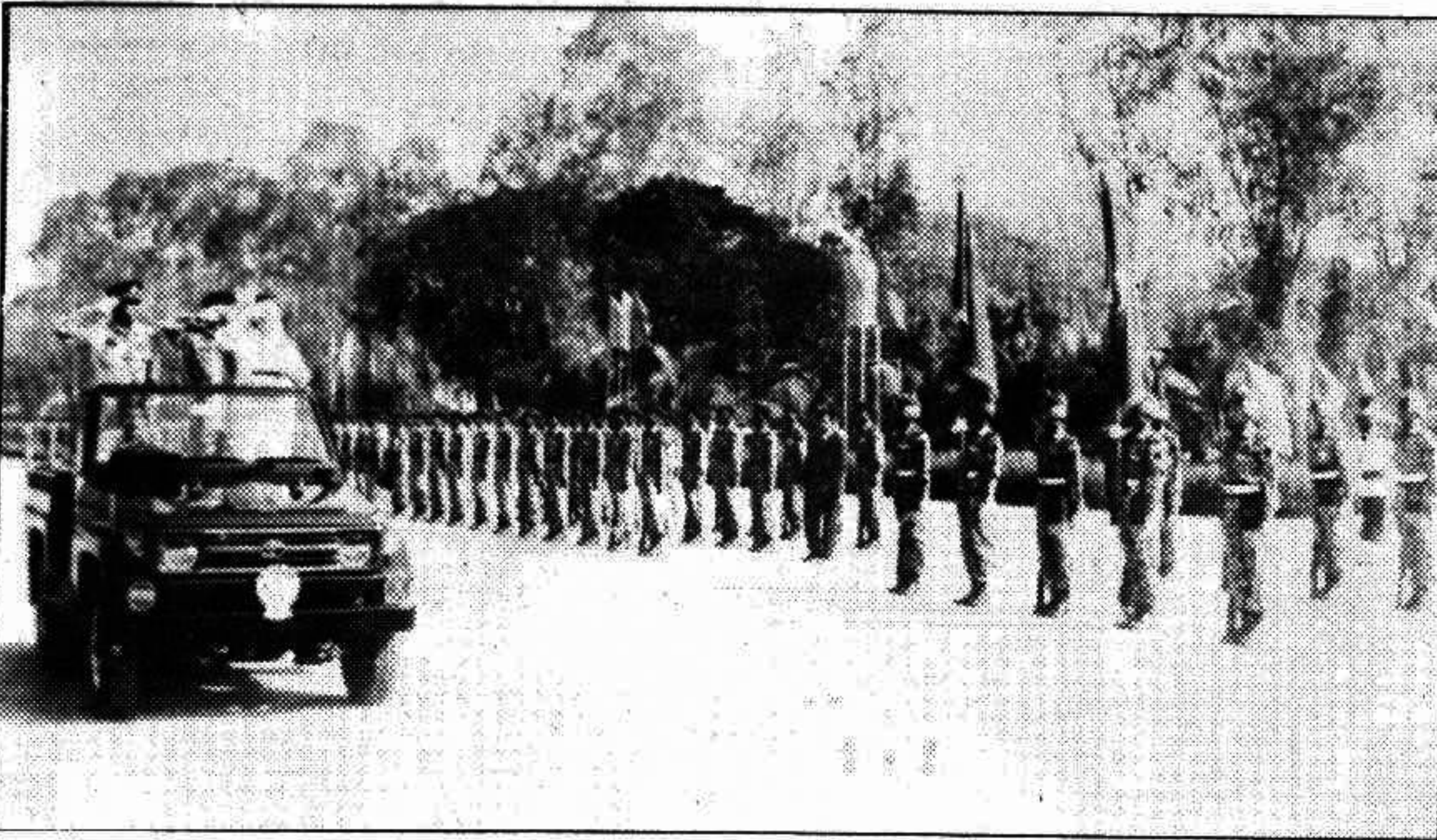
Prime Minister Sheikh Hasina inspecting a Guard of Honour at BDR headquarters in the city during the annual BDR parade yesterday.