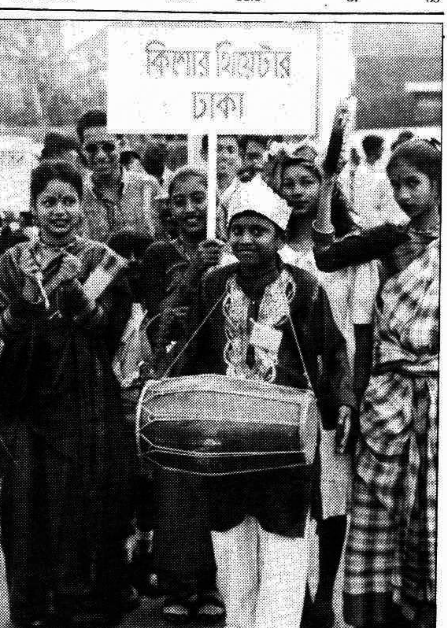
Children brought out a colourful procession in the city yesterday to mark the opening of National Shishu Kishore Drama Festival '99.