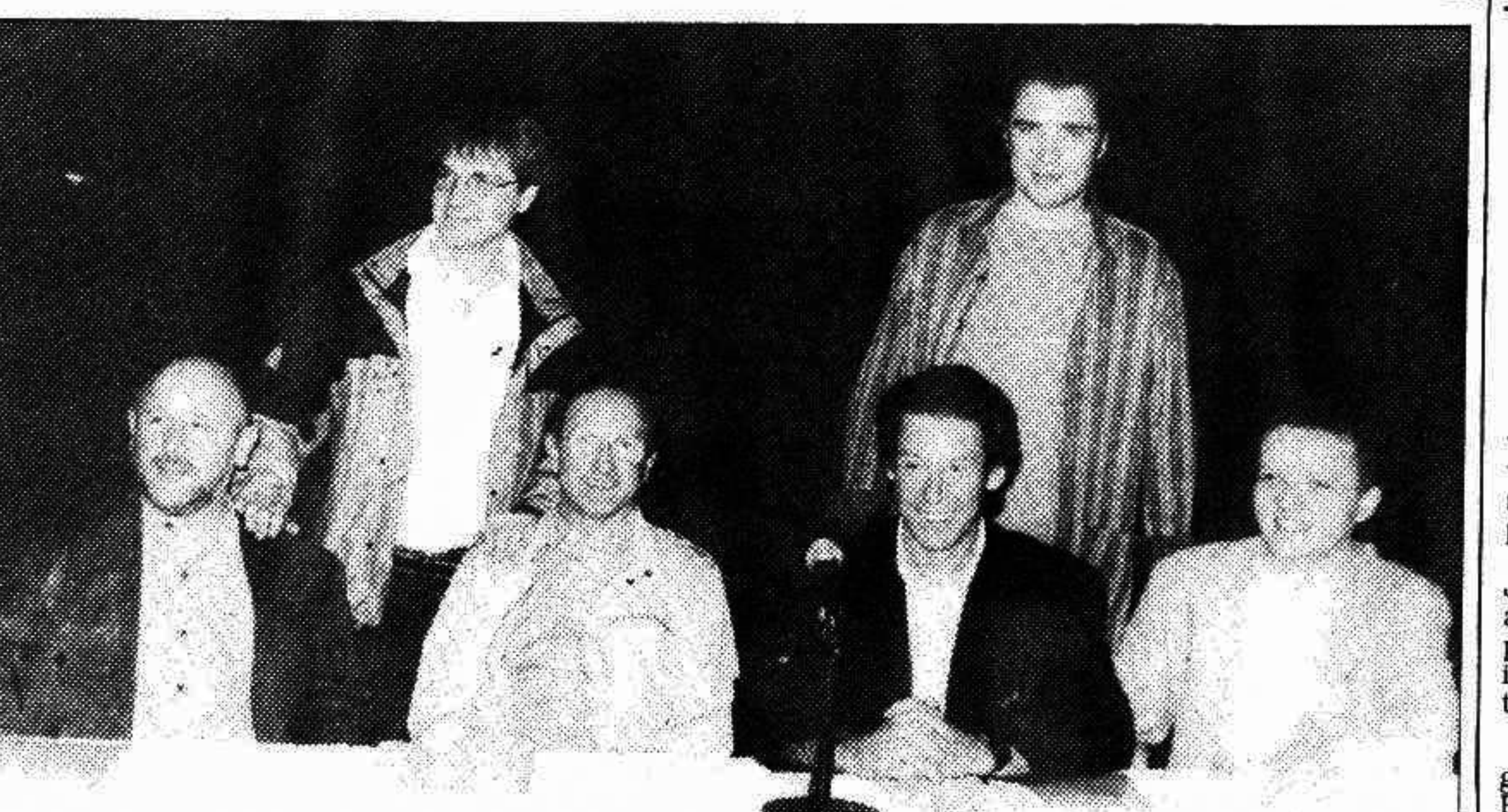
Members of The Wallace Collection, a brass band from the UK, held a press conference in the city yesterday. They will perform in the city on March 8 and 9 and in Chittagong March 6.

The workshop has been organised by the Department of Business Administration of the university.