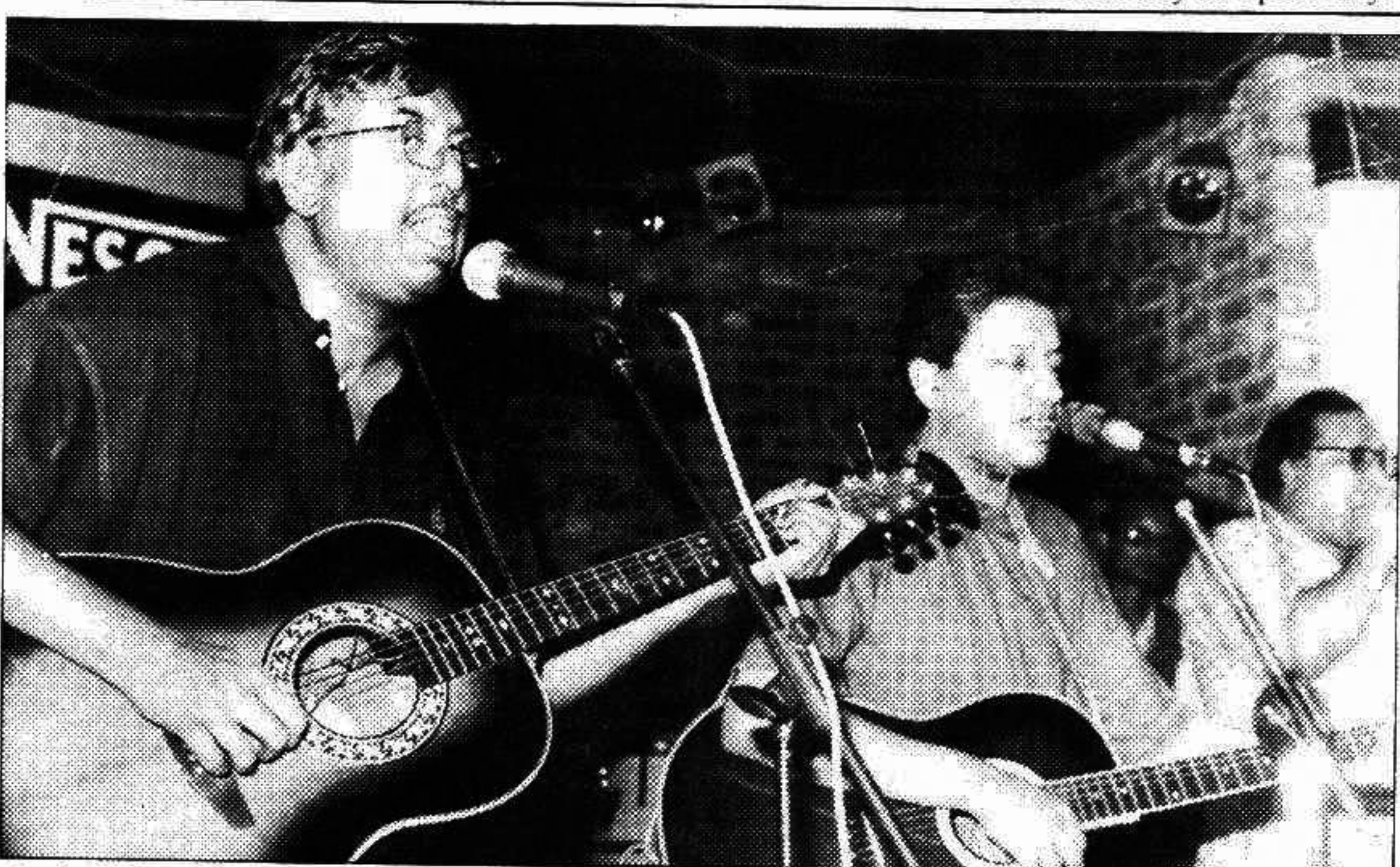
Artists rendering songs from old days at an evening of Classics Unplugged at Muktiyuddha Museum in the city yesterday. The event was organised by Nescafe.