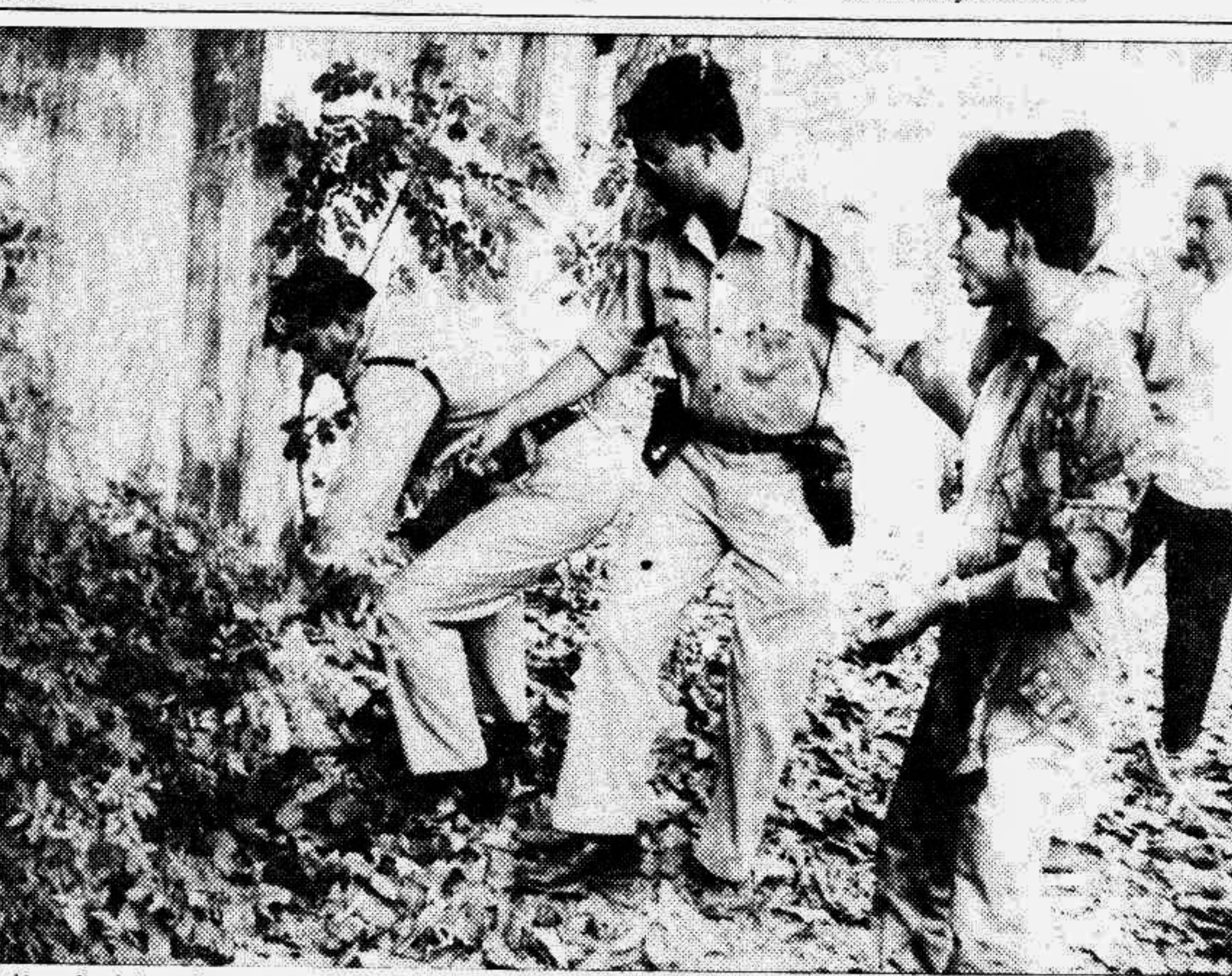
Police looking for arms yesterday near Mohsin Hall and A F Rahman Hall of Dhaka University following a confessional statement by an alleged terrorist arrested from city's Kalabagan area.

Fire Service sources said the fire originated from a kitchen and soon engulfed the entire area.