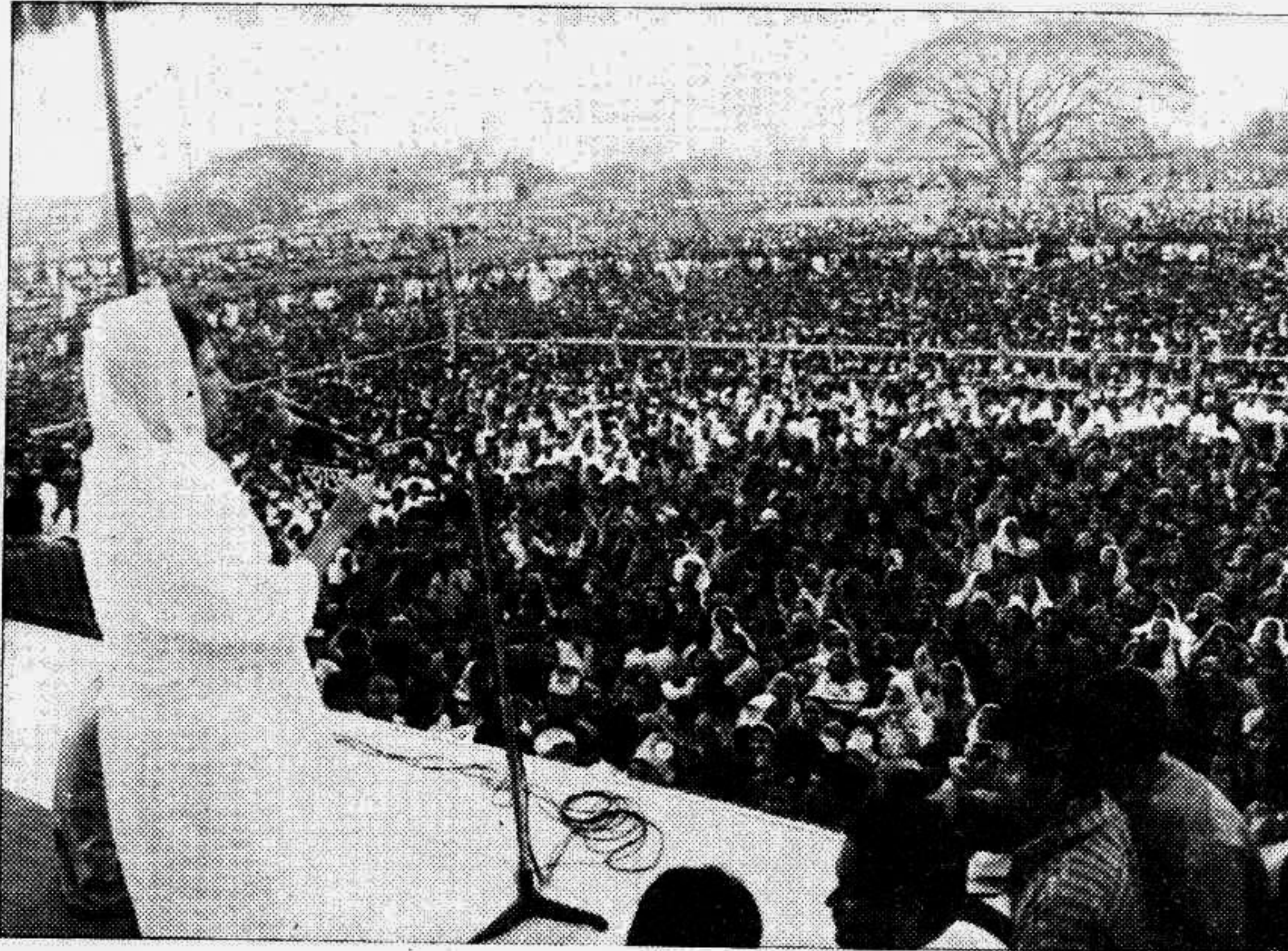
BNP chairperson Begum Khaleida Zia addressing a public meeting at Madhabpur stadium in Habiganj yesterday.