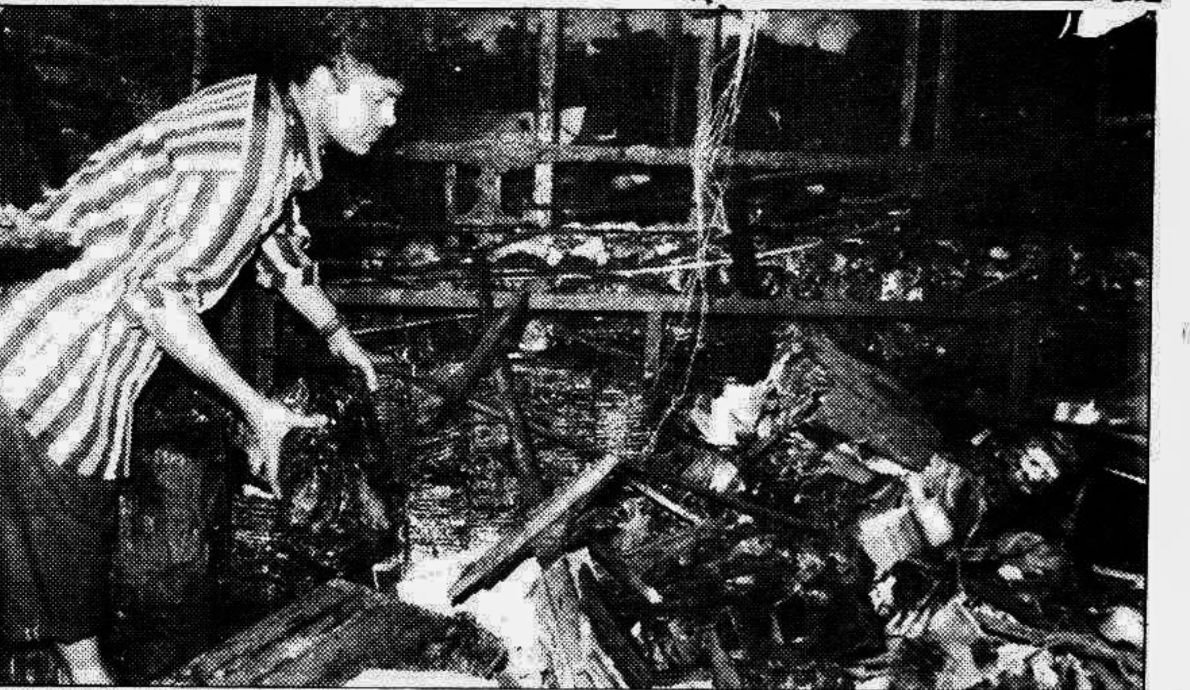
Three shops in the Baitul Mukarram electronics market were gutted in a fire on Tuesday night.

Police said a group of muggers stopped the journalist at gunpoint and also assaulted him and snatched the key of his motorcycle.