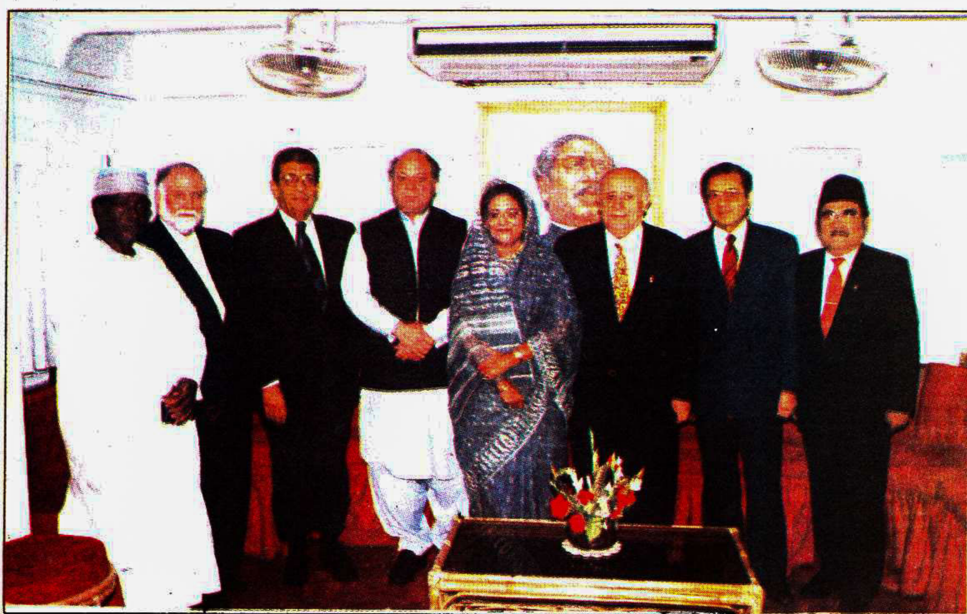
Leaders of the Developing Eight (D-8) pose for photograph on board VS Masud during a river cruise in the river Buriganga yesterday.

Published by the Editor from City Publishing House Ltd., 90 KKRail, Dhaka-1000 on behalf of Mediaworld Ltd., 52 Motiheel C.A., Dhaka-1000. Editorial, News & Commercial Offices: House No: 11, Road No: 3, Dhanmandi B/A, Dhaka-1205. PABX: 866772-4, Commercial: 866771, Fax No: 88-02-863035, GPO Box No: 3257, Cable: DAILYSTAR, DHAKA. Internet edition address: http://www.dailystarnews.com and Email address: dstar@bangla.net