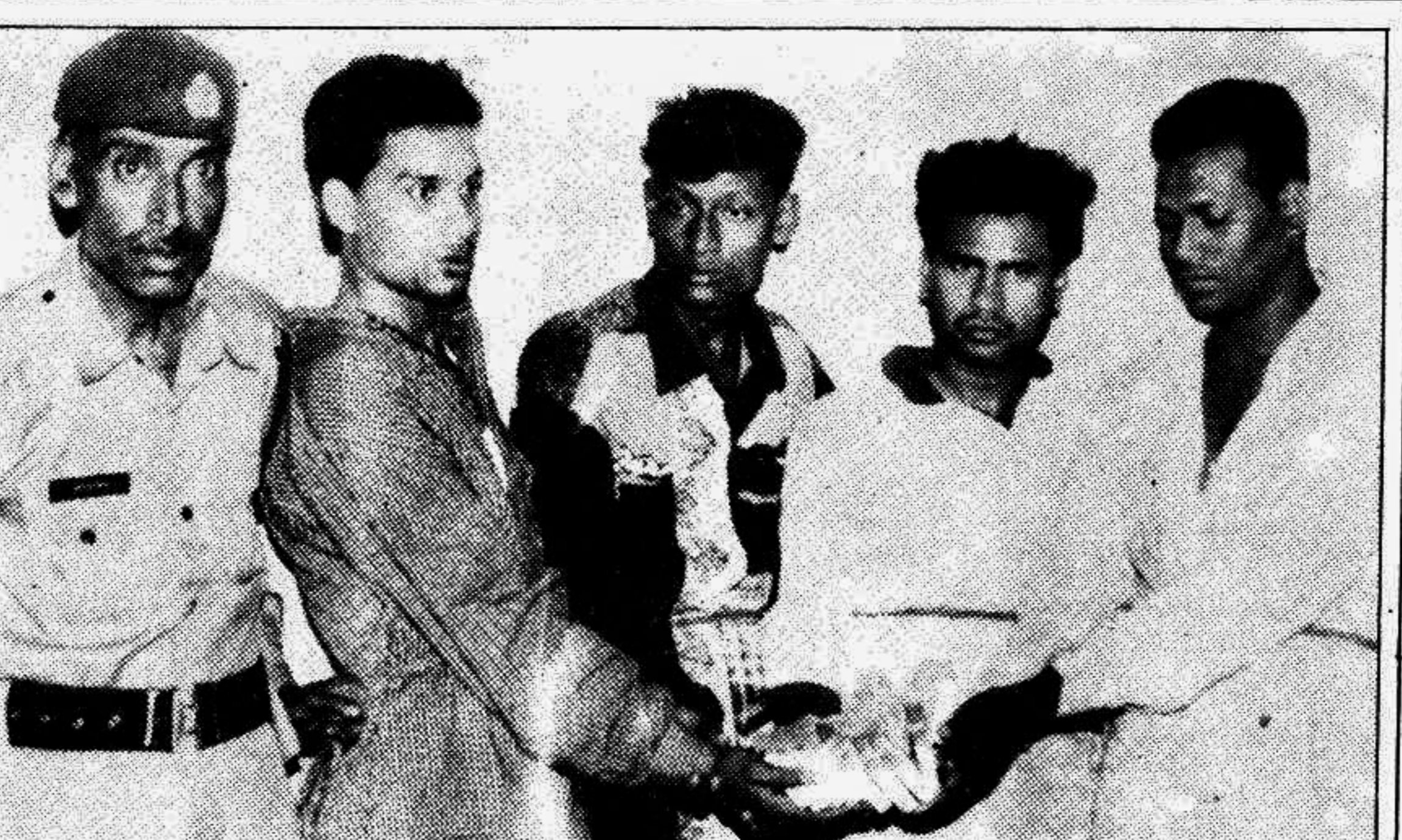
Four muggers were arrested for snatching Tk 3,00,000 from an official of Concord Engineering and Construction Ltd when he was going to deposit the money with a bank at Gulshan in the city on Sunday.

About 12 tons of urgent humanitarian aid from Turkey's Red Crescent is expected to arrive in the city today, reports UNB.