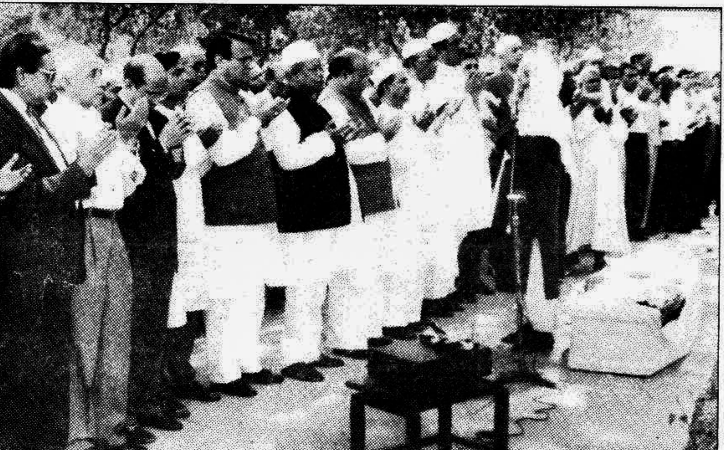
Namaj-e-Janaza of Foreign Secretary Mustafizur Rahman was held at the premises of the Ministry of Foreign Affairs in the city yesterday.

ists will stage their week-long protest against the opposition party's U-turn. 'We will strike at the very roots of the Congress to expose their double standards,' the BJP spokesman said.