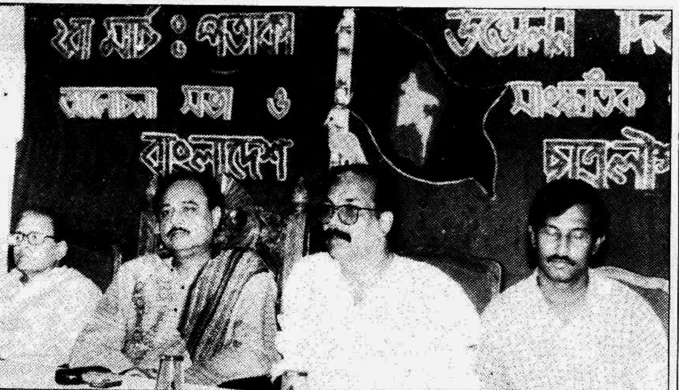
Livestock and Fisheries Minister ASM Abdur Rob speaking at discussion meeting marking the National Flag Hoisting Day at the Jatiya Press Club yesterday.