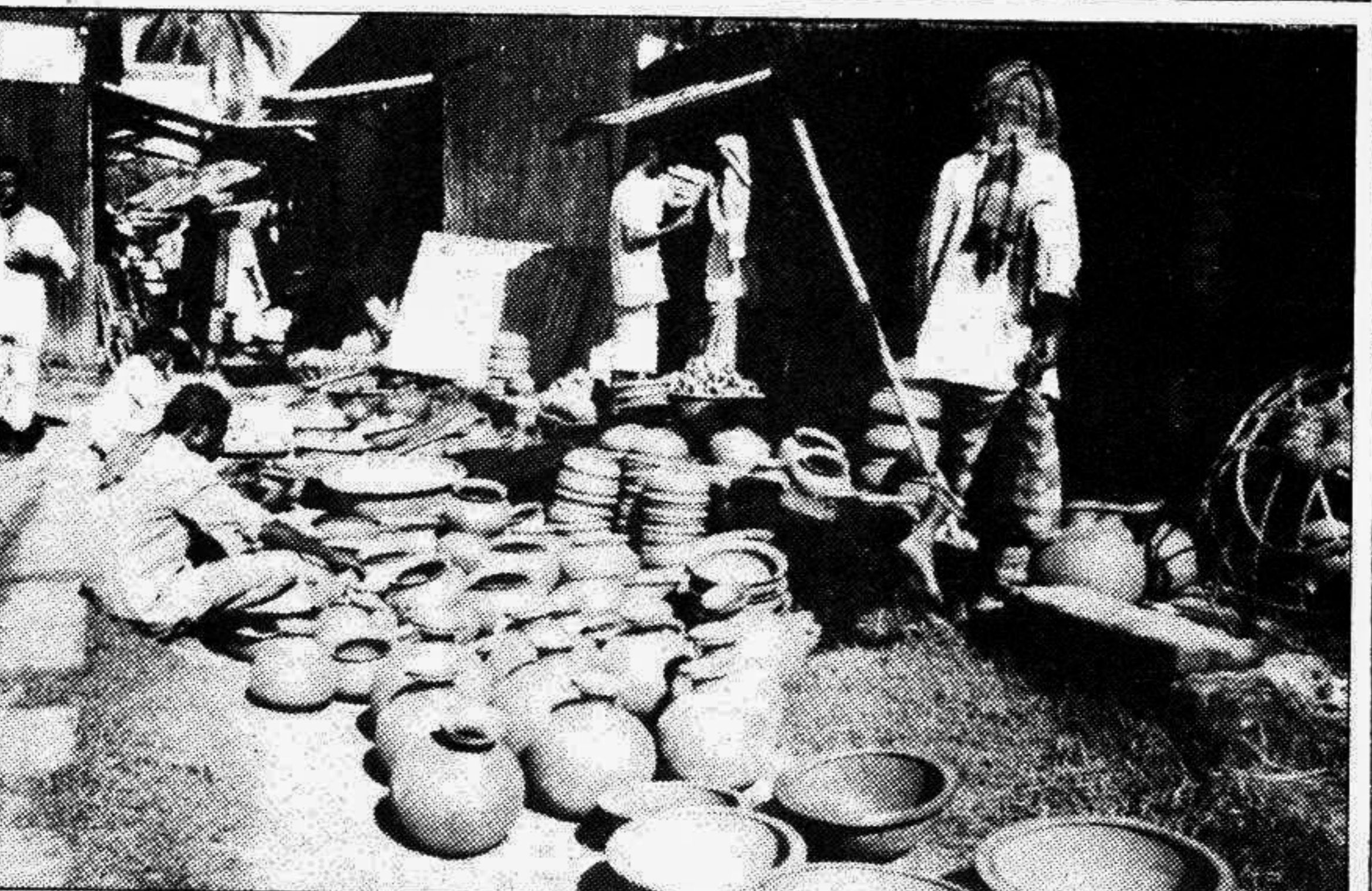
MAGURA: Potter families here facing very bad days now due to lack of government patronisation, high price of raw materials, non-availability of bank loan and problems of marketing. Photo shows potters waiting for customers with their products at a rural market.

Many railway lands in Kalibari Court Stations and many other stations are being grabbed by unauthorised persons. It is alleged many railway lands are leased out illegally. Many shops, hotels and restaurants are being constructed in railway stations causing inconvenience to passengers.