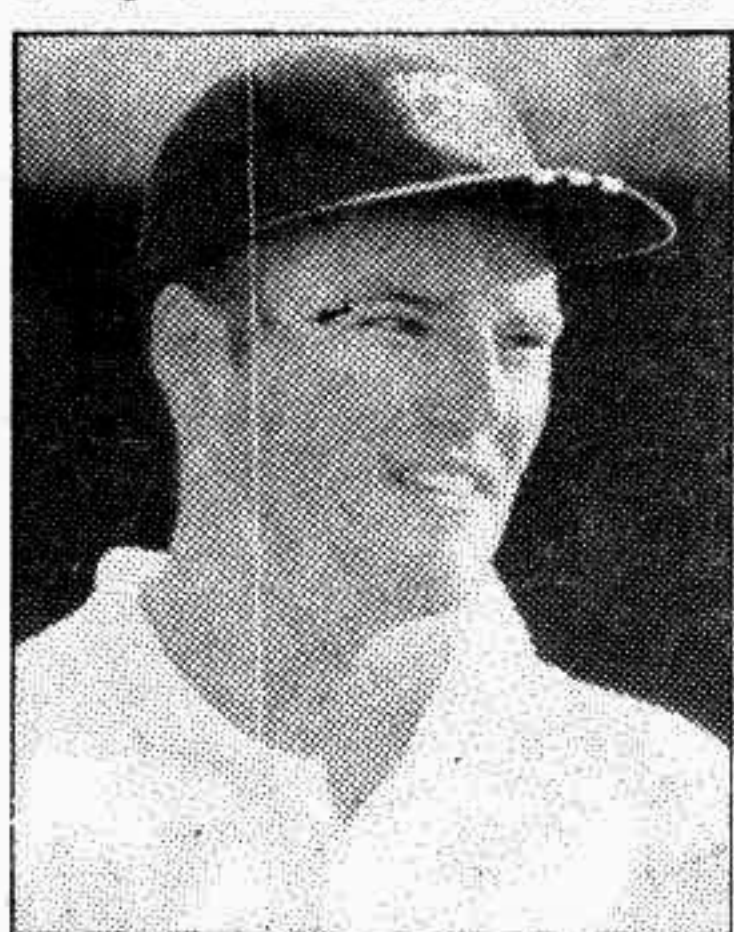
MacGill ... 6-wkt haul

Ganga returned at the fall of Phillip and went on to make 15, one of only three double figure contributions in the innings. But when he was caught behind driving at MacGill, it sparked a collapse in which the last four