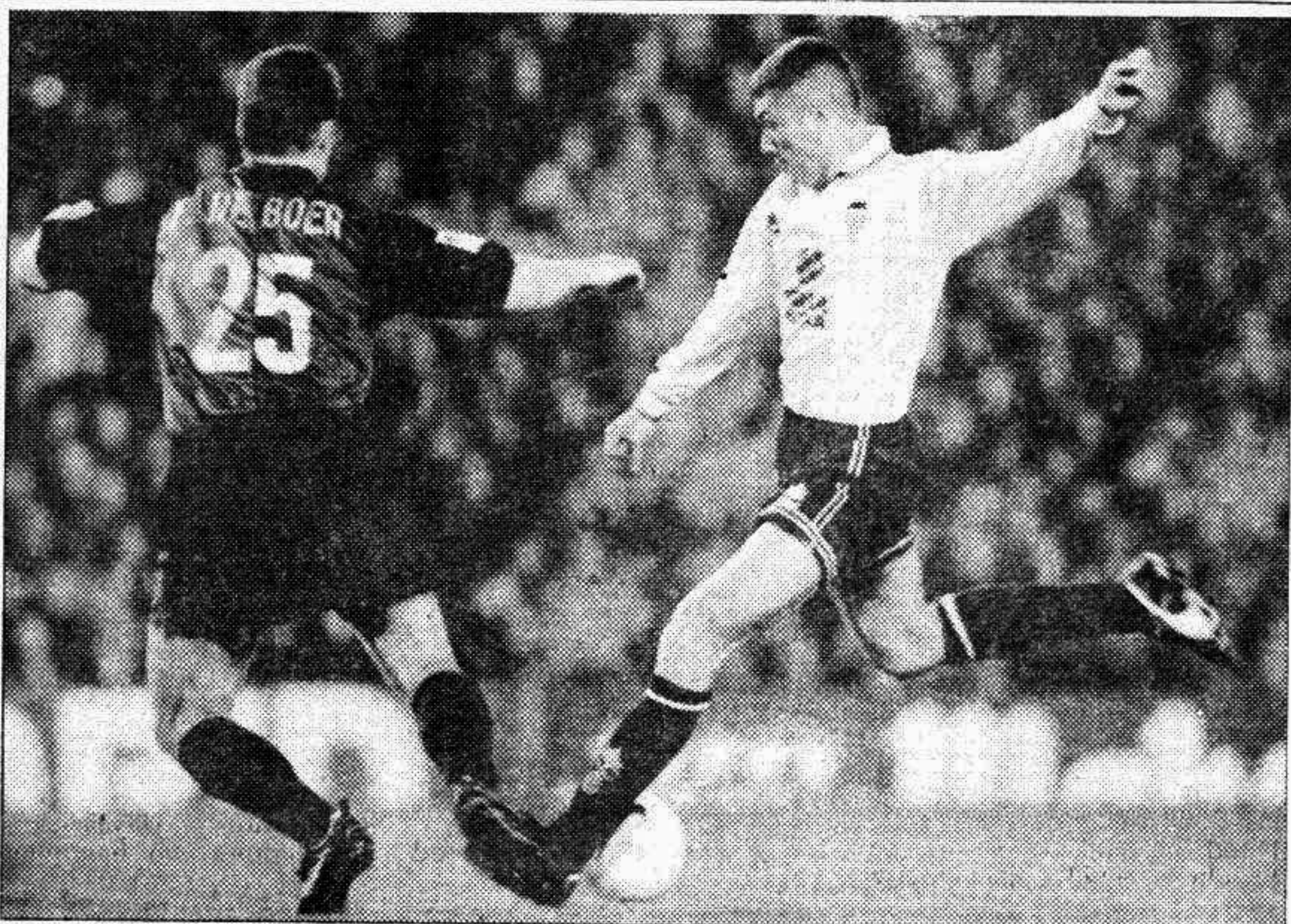
'THE COBRA'S ABOUT TO BITE': Valencia's Romanian superstar Adrian Ilie (R) - nicknamed the 'Cobra' - about to unleash a shot past Barcelona's Dutch international Ronald de Boer to open the scoring in their 4-2 Primera Liga win at the Nou Camp on February 27.