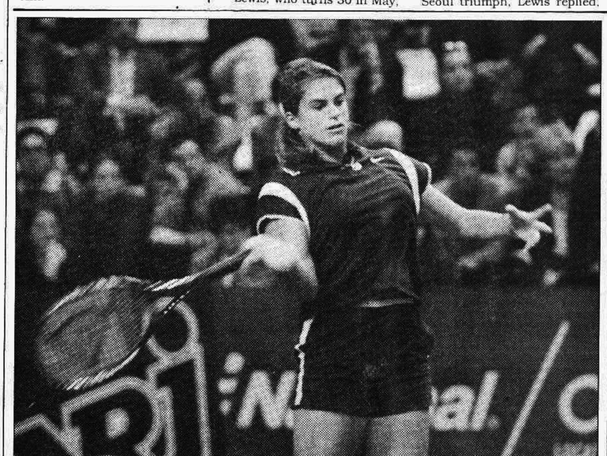
Frenchwoman Amelie Mauresmo in action against Martina Hingis at the Gaz de France on February 26.