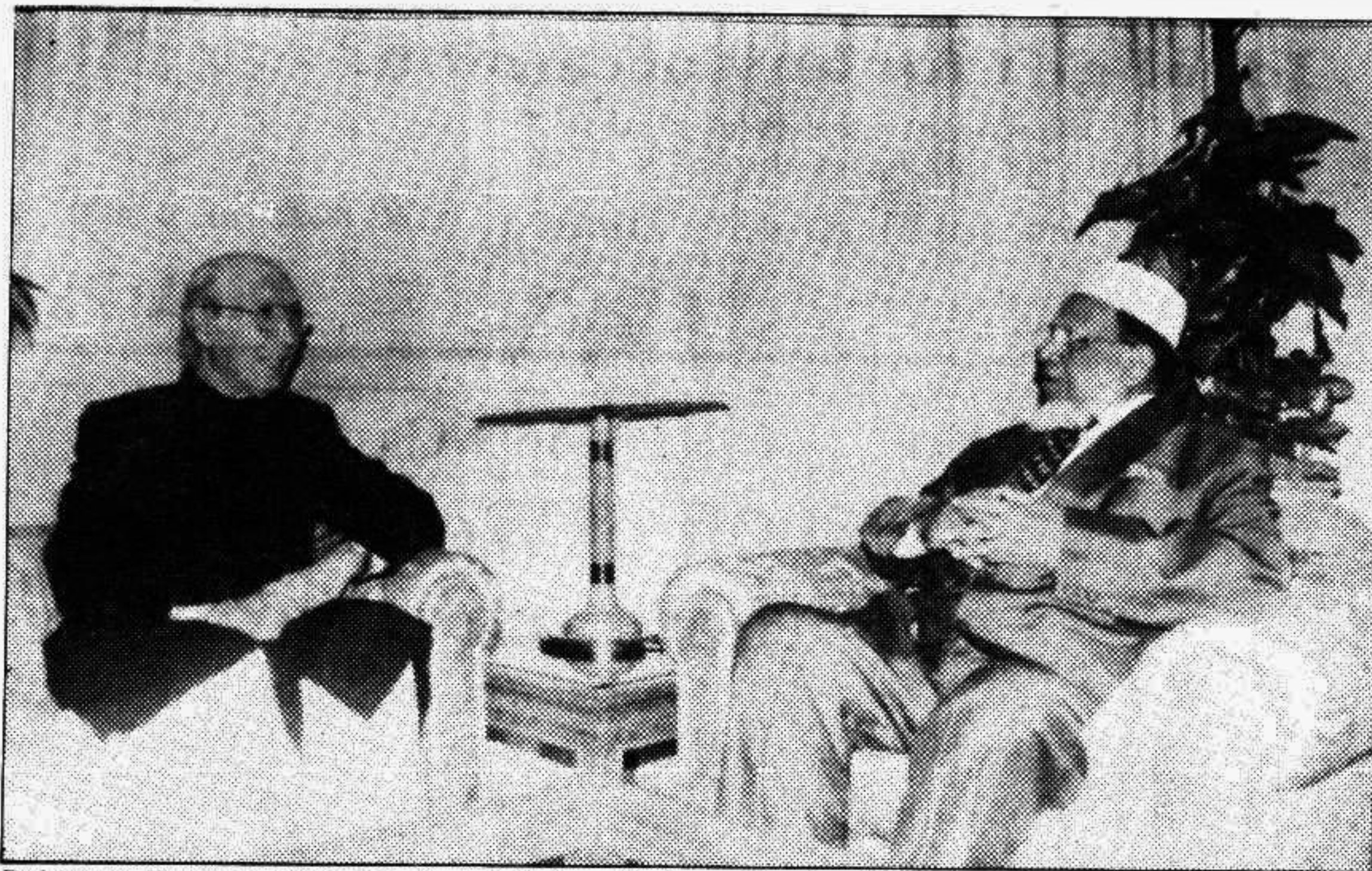
Pakistan Foreign Minister Sartaj Aziz called on Foreign Minister Abdus Samad Azad at a city hotel on Friday.