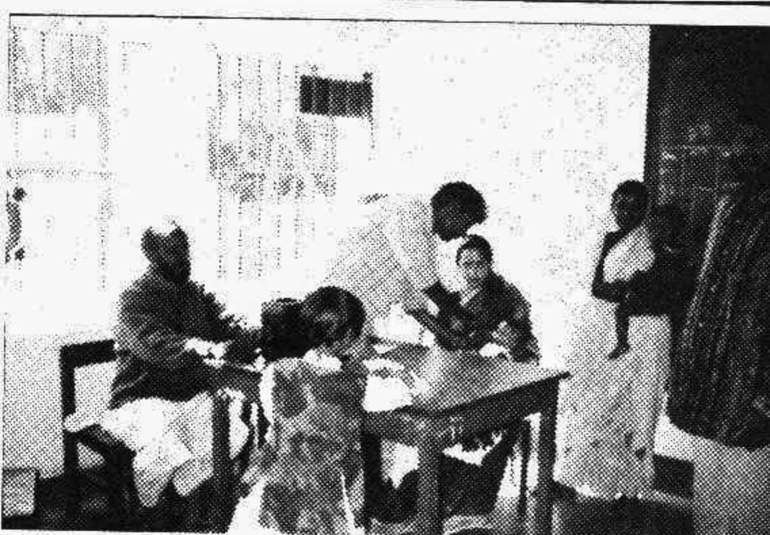
MAGURA: National immunisation campaign at a union health and family welfare centre here.

It also said the use of surface water would bring back the ecological balance in the region and remove the acidity of the land to make it fertile.