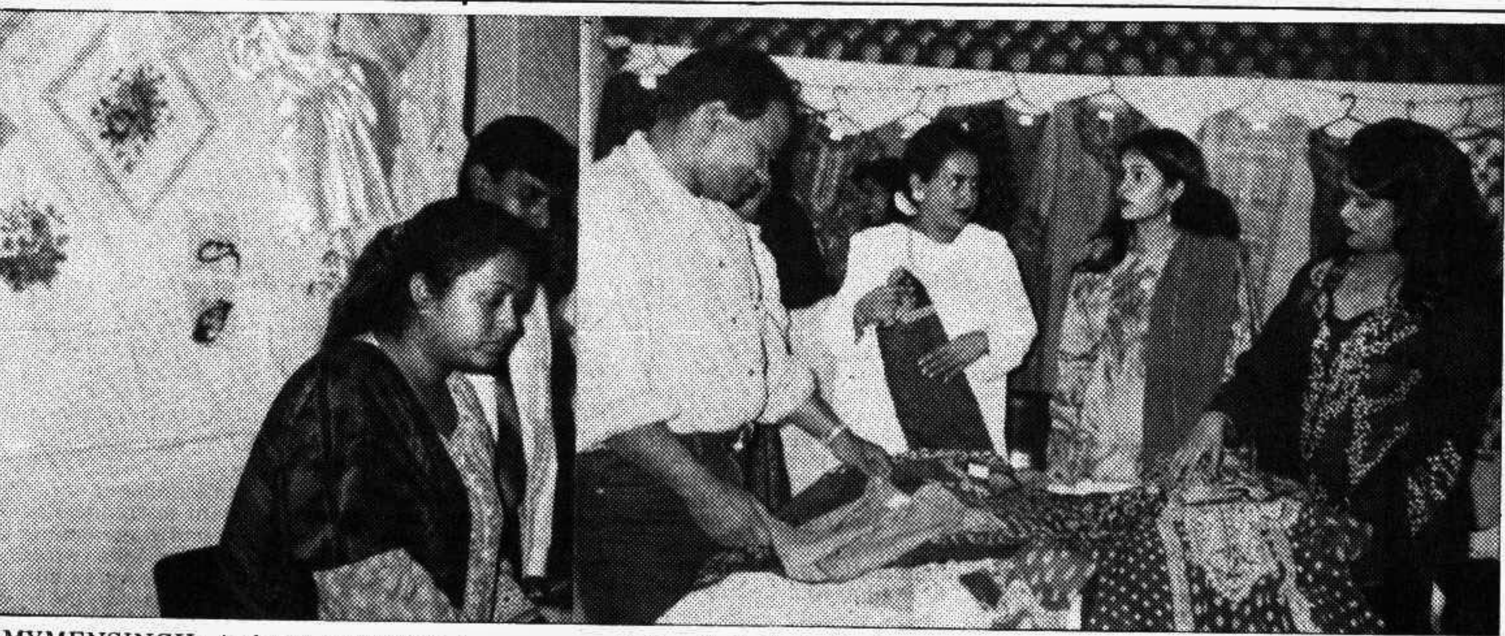
MYMENSINGH: A dress exhibition in progress at Bangladesh Agricultural University (BAU) Club building which was held recently here.

Meantime, local people complain that air in the locality is thick with carbon dioxide, as a result of which people have been suffering from various diseases.