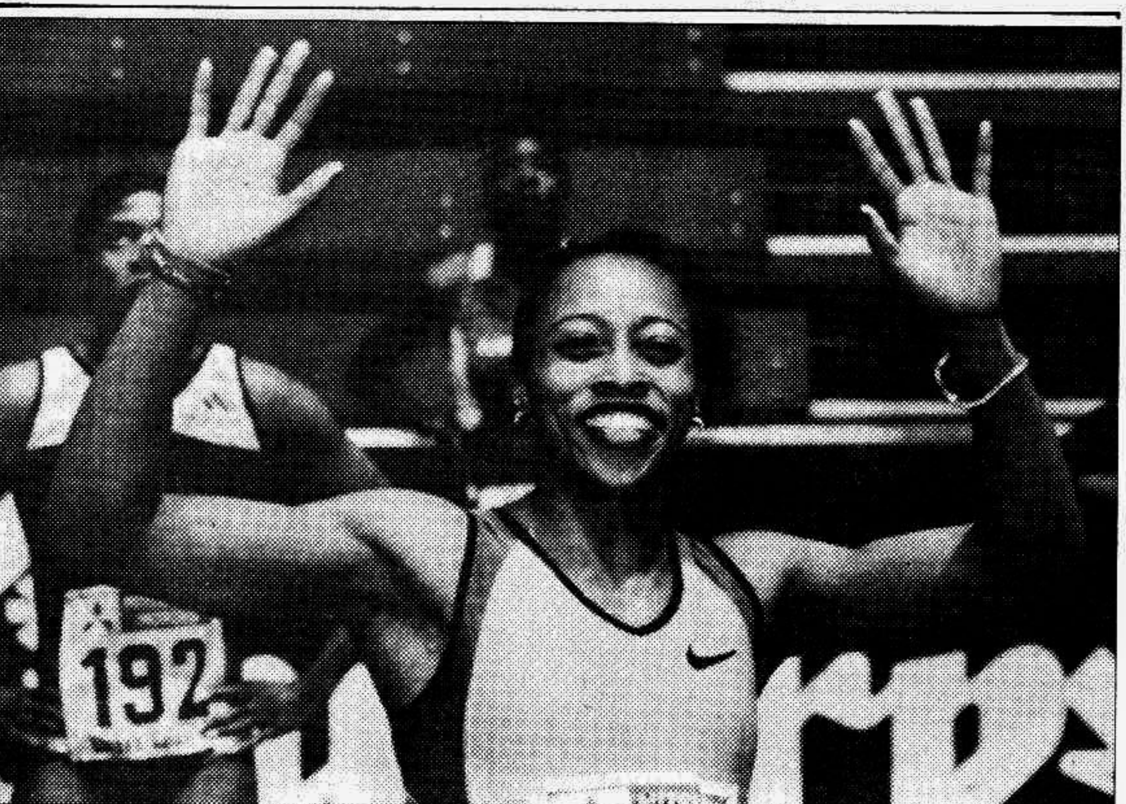
American Gail Devers celebrates after victory in the 60 metres final at an indoor meeting in Stockholm on February 25.

Stevens is looking at several options to force change in the aftermath of the corruption scandal surrounding the 2002 Games in Salt Lake City. McCabe said. The options under consideration include taking away or limiting the IOC's tax-exempt status and the revenue it earns from broadcast rights.