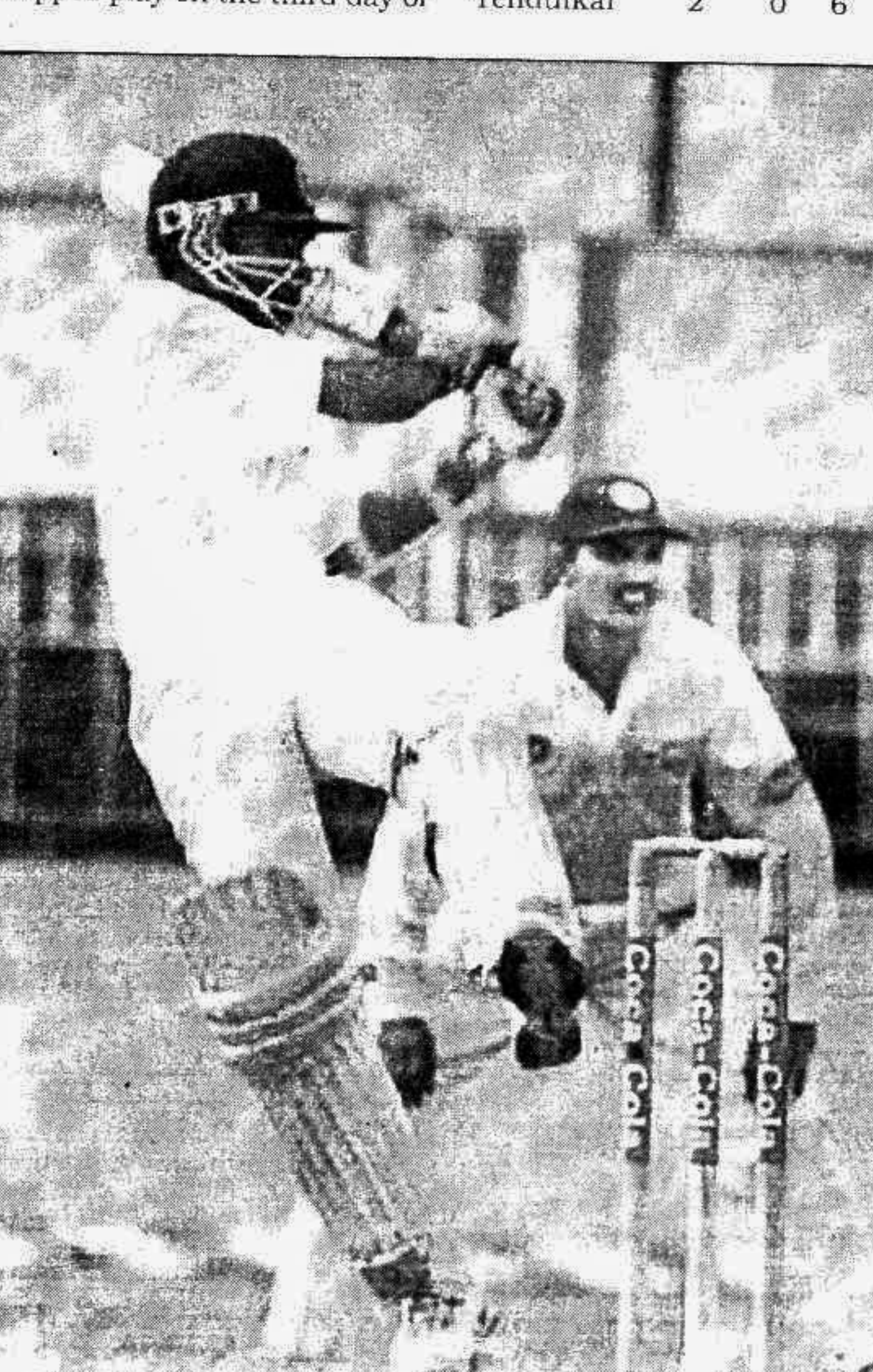
Sri Lanka's Mahela Jayawardena pulls during the third day's play in Colombo yesterday.