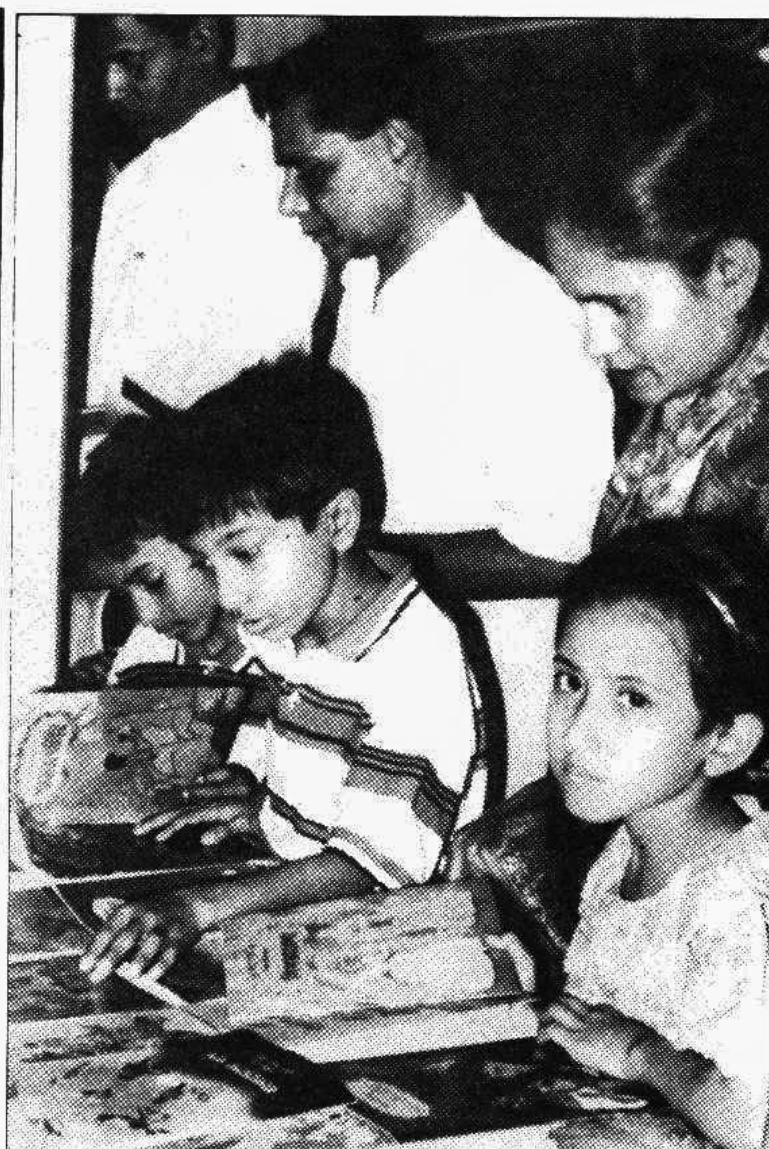
After a three-day hartal, the Ekushey Book Fair at Bangla Academy drew a large crowd yesterday, a public holiday.

Now it is the health authorities who have to do something about the menace that is said to be one more problem plaguing our medicare system. Observers are of the opinion that only prompt and decisive action against the criminals engaged in this hazardous malpractices can retrieve the situation.