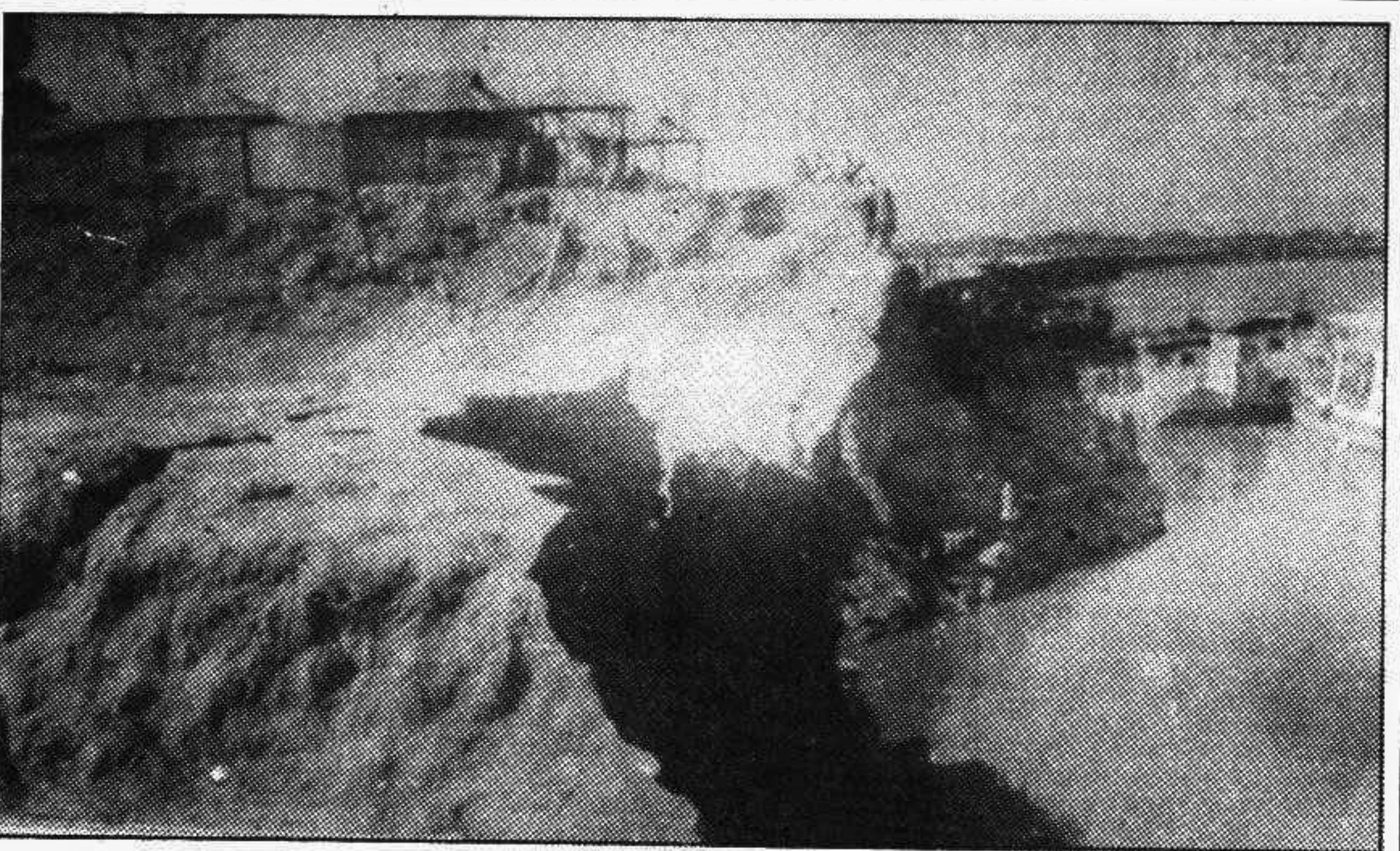
GAIBANDHA: A vast tract of land has already been devoured by erosion of the river here. Now Balashi-Gaibandha road is threatened.

When contacted, BIWTA sources here said the authorities have not taken any measure as yet to ensure smooth plying of river vessels despite the fact that the routes have become hazardous for the launches and other vessels.