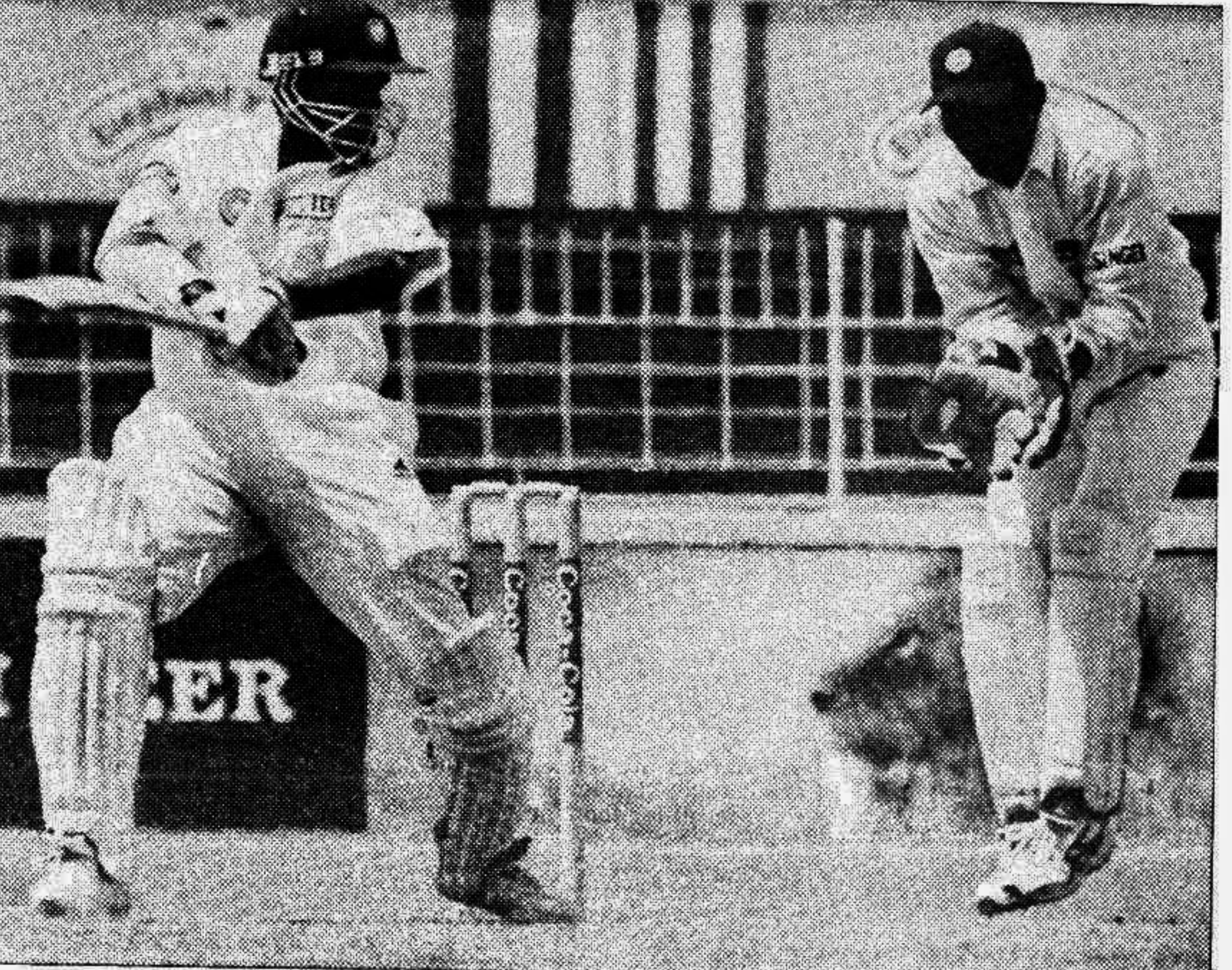
Saurav Ganguly cuts during the Indian innings yesterday.

"But it depends on pitch and outfield at the Chittagong M A Aziz Stadium as well as the consent of the boards of Kenya and Zimbabwe," BCB president He said. "I am personally interested to hold a match during the tri-nation tour-