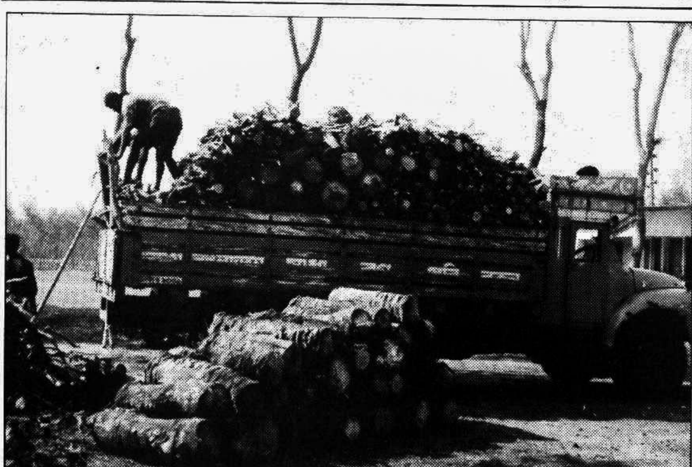
JHENIDAH: Indiscriminate cutting of trees going on unabated here defying government ban on it. Photo shows a truck is being loaded with such fuel woods made by cutting date trees recently at Royerah bazaar in Saikupa thana.

If the breaking of these powerful agencies with regard to freedom of the press is left to the government the danger is that freedom of the press might itself become a casualty in the process. For freedom of the press is essential to political liberty, you must be able to convey your thought freely to other — where freedom of expression exists the beginnings of a free society — are already present, Hutchins observed in his reports.