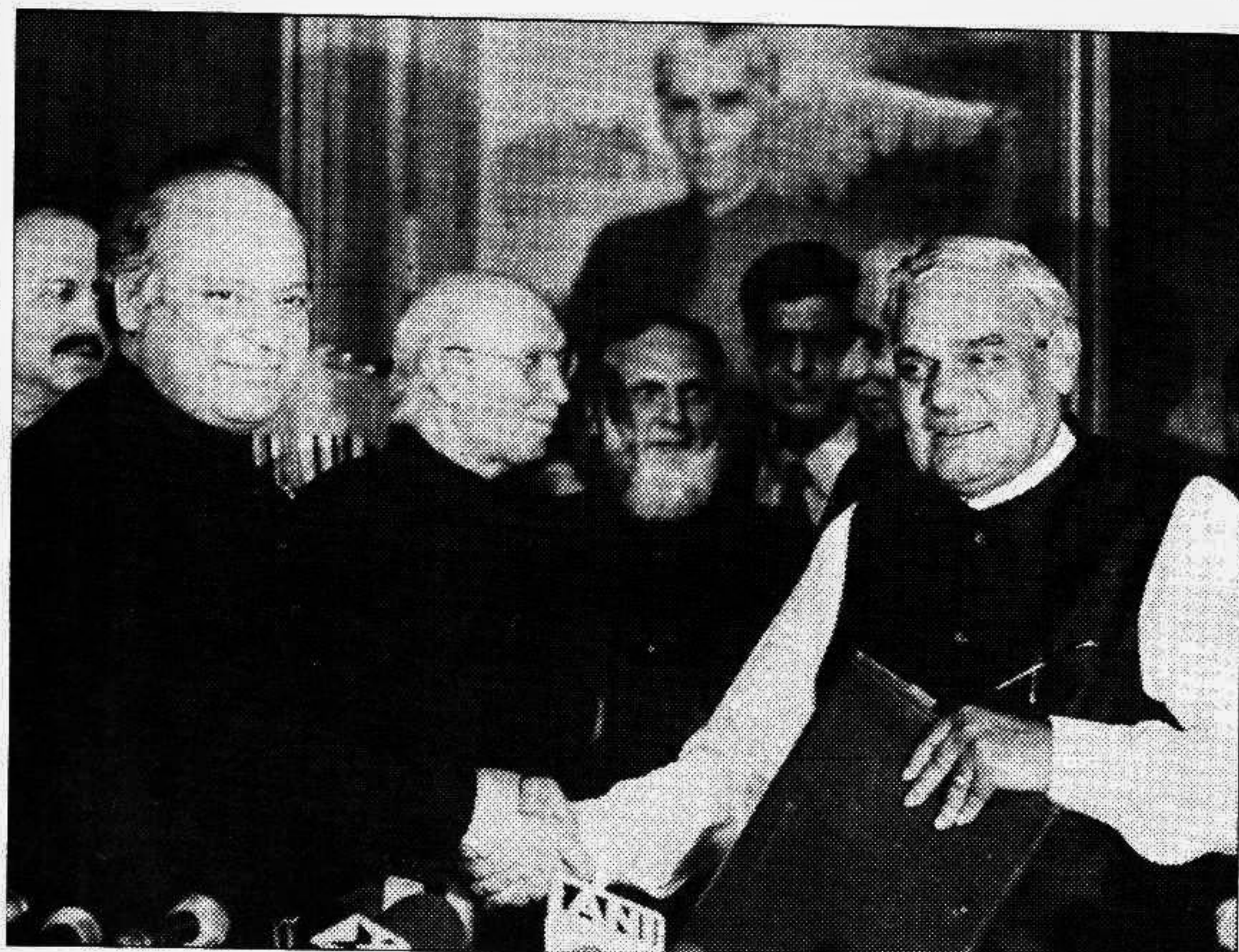
Pakistani Prime Minister Nawaz Sharif (L) shakes hands with his Indian counterpart Atal Behari Vajpayee (R) after signing a joint declaration at Governor House in Lahore on Sunday.

LAHORE, Feb 22: The prime ministers of Pakistan and India yesterday vowed to try to reduce the risk of an accidental nuclear war, reports AP.