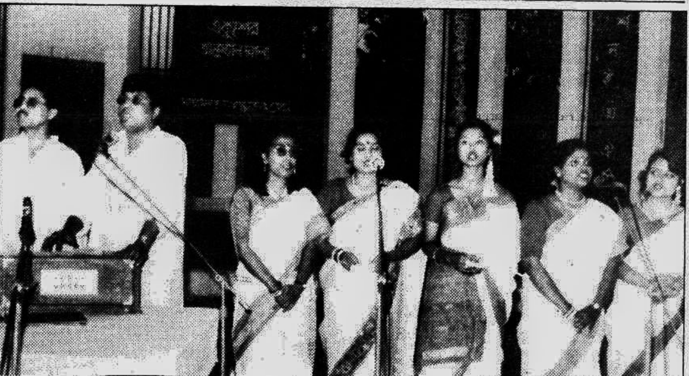
Surbani Sangskritik Goshthi rendering songs at the Central Shaheed Minar yesterday as part of Ekushey programmes organised by Sammito Sangskritik Jote.

About 140 representatives from the government, NGOs, civil society and the World Bank, who take interest directly and indirectly in the policy issues of the health and education sectors, will take part in the session.