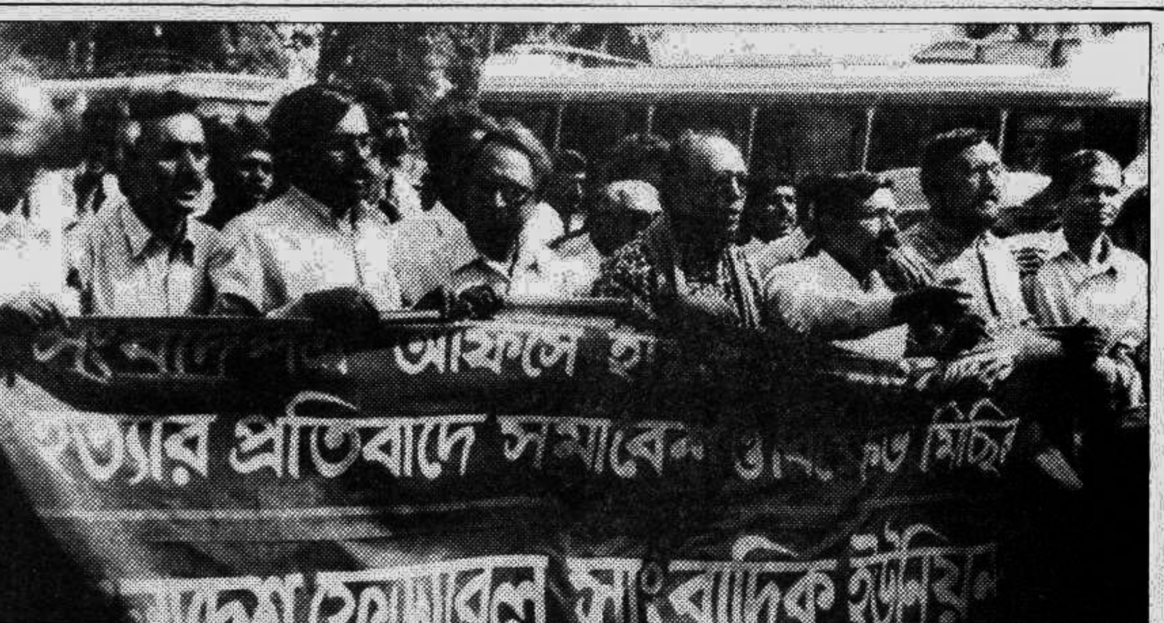
BFUJ brought out a procession in the city yesterday protesting the attack on newsmen and newspaper offices during hartal hours.

Prof Dr Tahmina Hossain said the government has taken up 36 women development projects under the current five year plan.