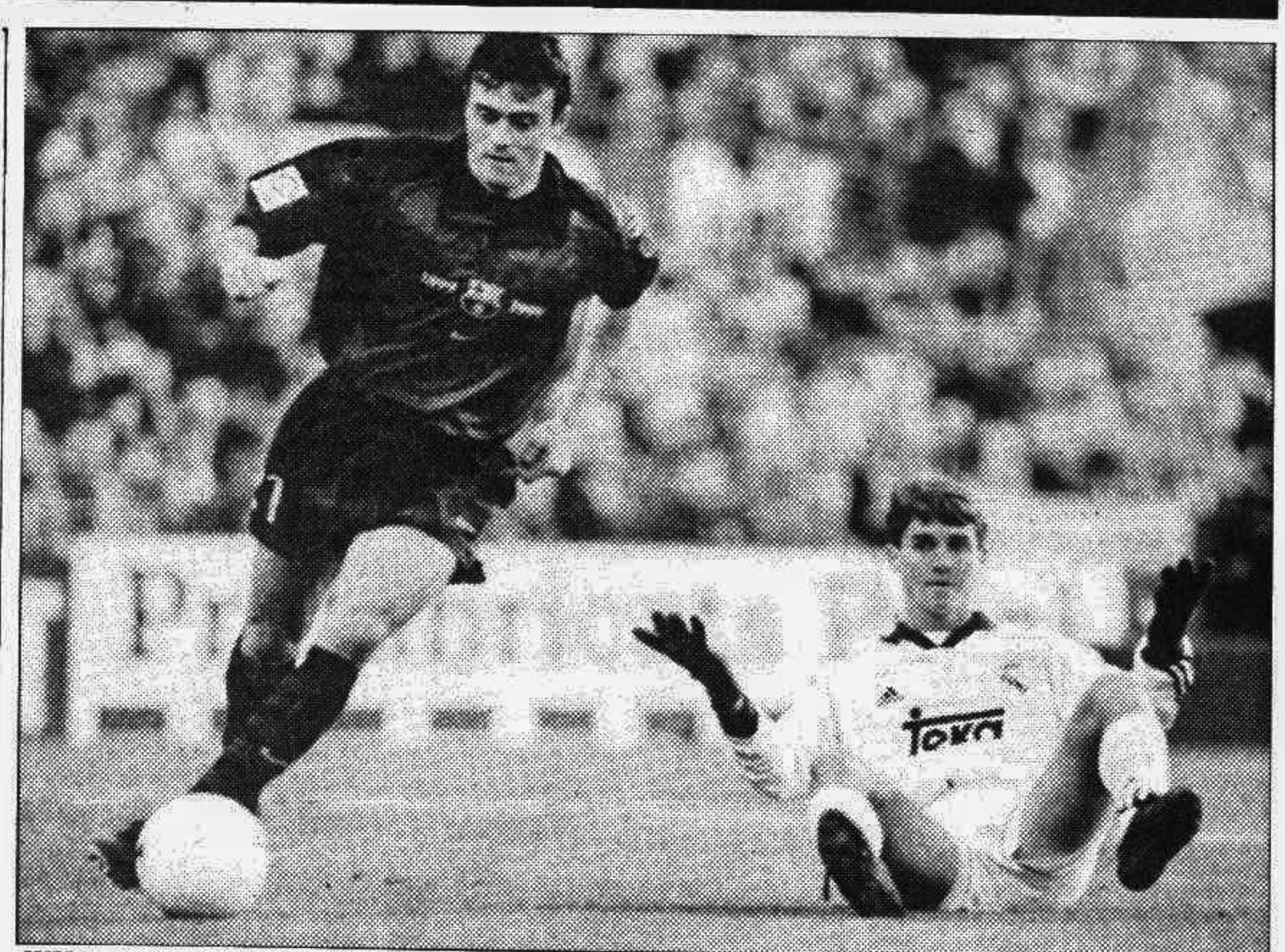
WHAT CAN I DO? IT'S HIS DAY: Real Madrid's Brazilian playmaker Savio(R) gives up as Barcelona's two-goal hero Luis Enrique Martinez races away with the ball during their Primera Liga fixture at Barcelona on Sunday.

"True, we are searching for a new coach for our national team but Maradona is not among the proposed names to fill the job," Fahd al-Ahmad al-Sabah, head of Kuwait's soccer federation and president of the Olympic Council of Asia, told the news agency. He was responding to the remarks by the Argentine legend.