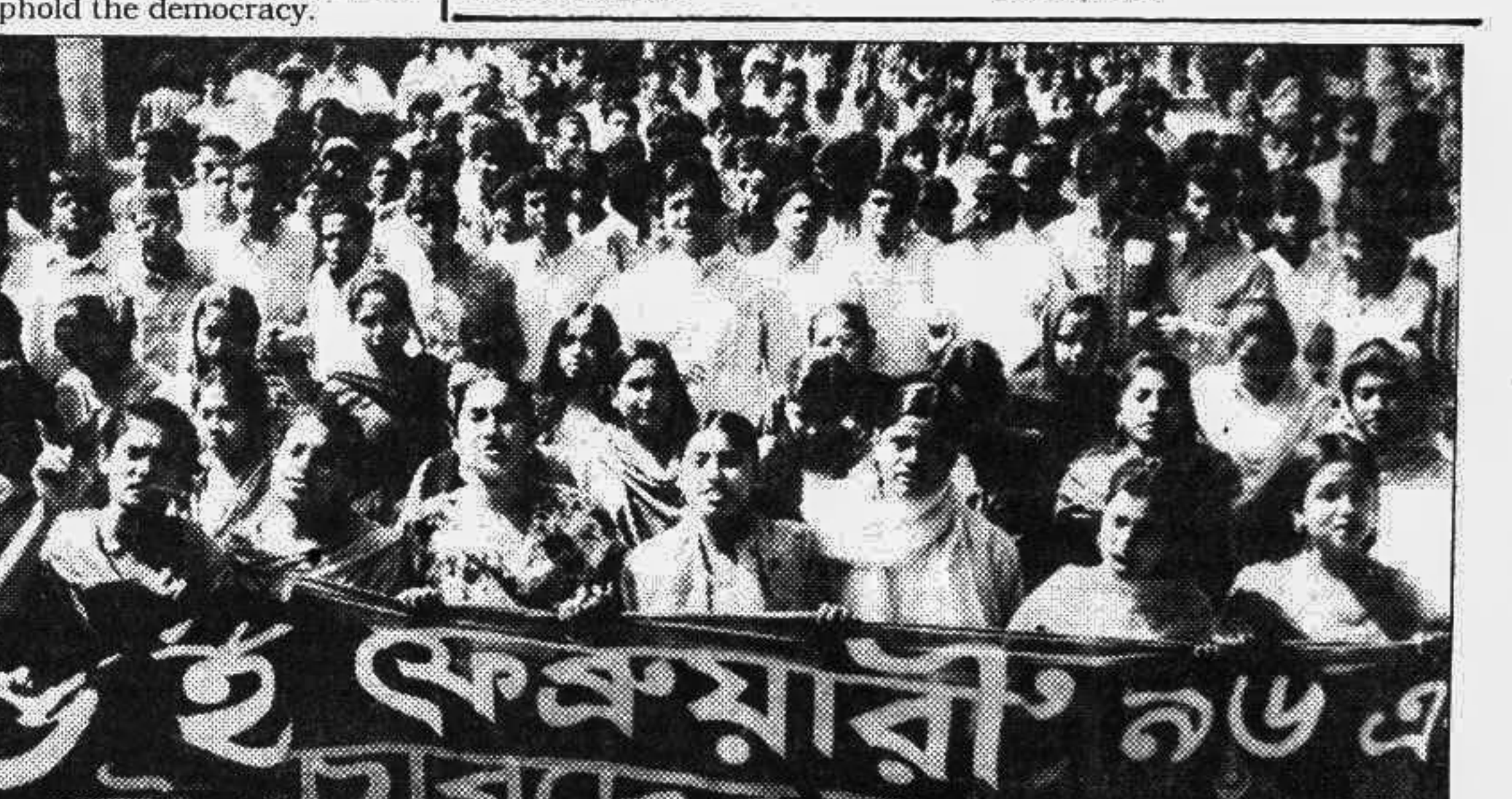
A Bangladesh Chhatra League (BCL) procession marking the 'Democracy Killing Day' on the Dhaka University campus yesterday.