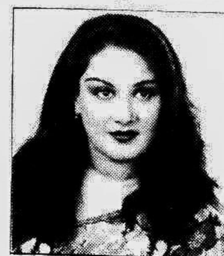
From Family & Friends