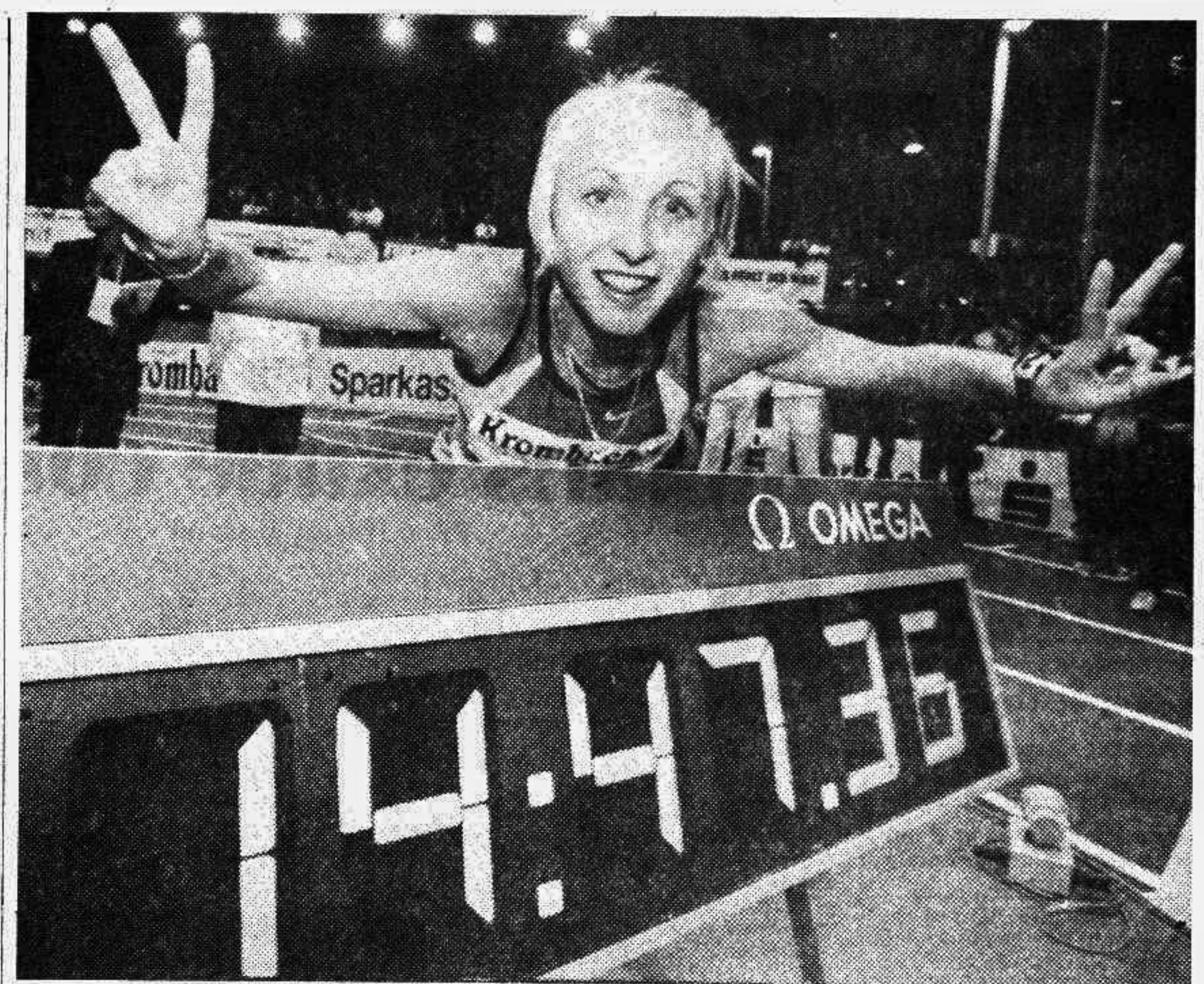
Gabriela Szabo celebrates her 5000 metres world indoors record in front of the display board at Dortmund on February 13.

Rosset bounced back with a service break in the sixth game and broke again in the 10th. Prinosil saved one match point but, faced with another against him, he hit an easy forehand into the net.