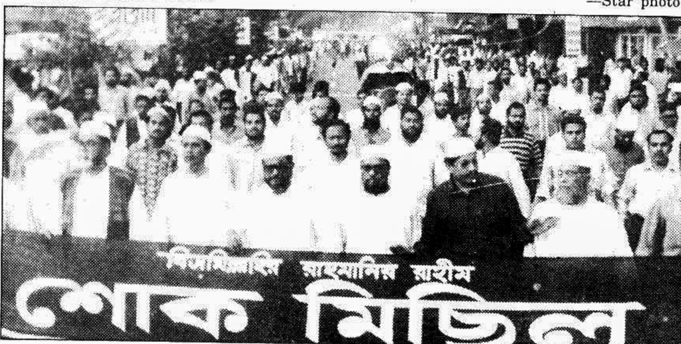
A Jamaat-e-Islami, Bangladesh procession mourning the deaths of those killed in the hartal yesterday in the city.