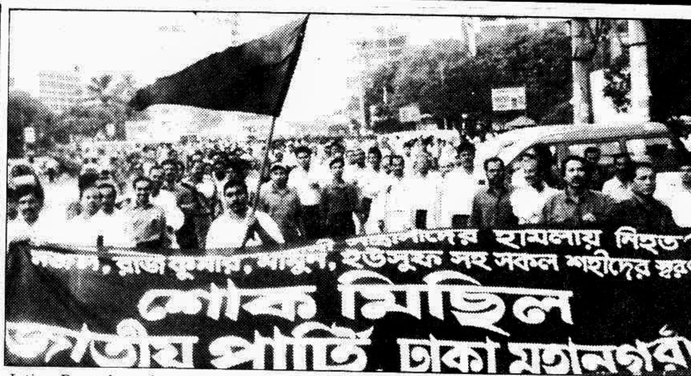
Jatiya Party brought out a mourning procession in the city yesterday for those who were killed in the 60-hour hartal.