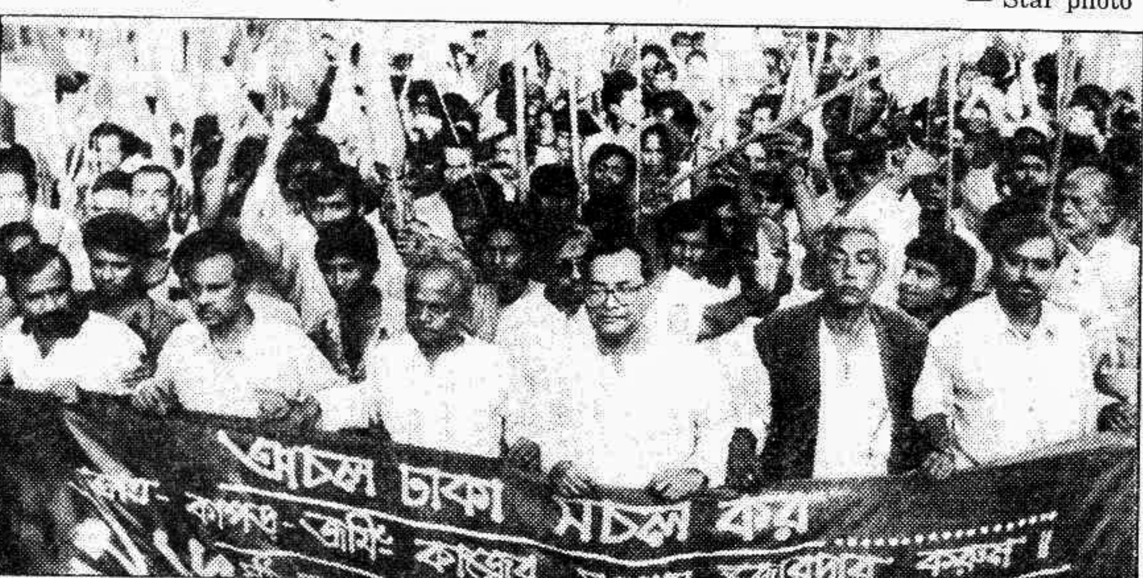
The Communist Party of Bangladesh (CPB) led by its newly-elected members of the executive committee paraded the main thoroughfares of the city yesterday.