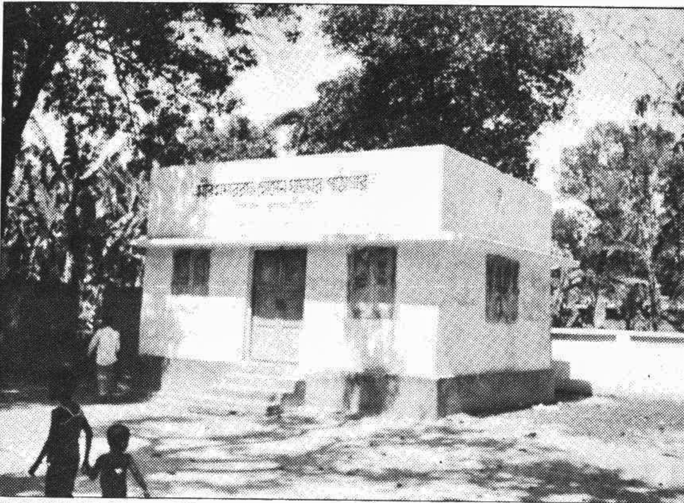
KUSHTIA: Mir Mosarraf Hossain's memory is about to be lost in oblivion due to lack of proper preservation. At present there is only a museum and a library at Lahinipara, three miles off Kushtia town.

Calcutta. Earlier, he studied at Kirsnanagar Collegiate School. He worked as manager of Gaznavi Estate in Tangail district where he spent a few years. He was a proud father of five sons and daughters. He breathed his last on December 19, 1911 at village Pangsa. Mosarraf Hossain is still