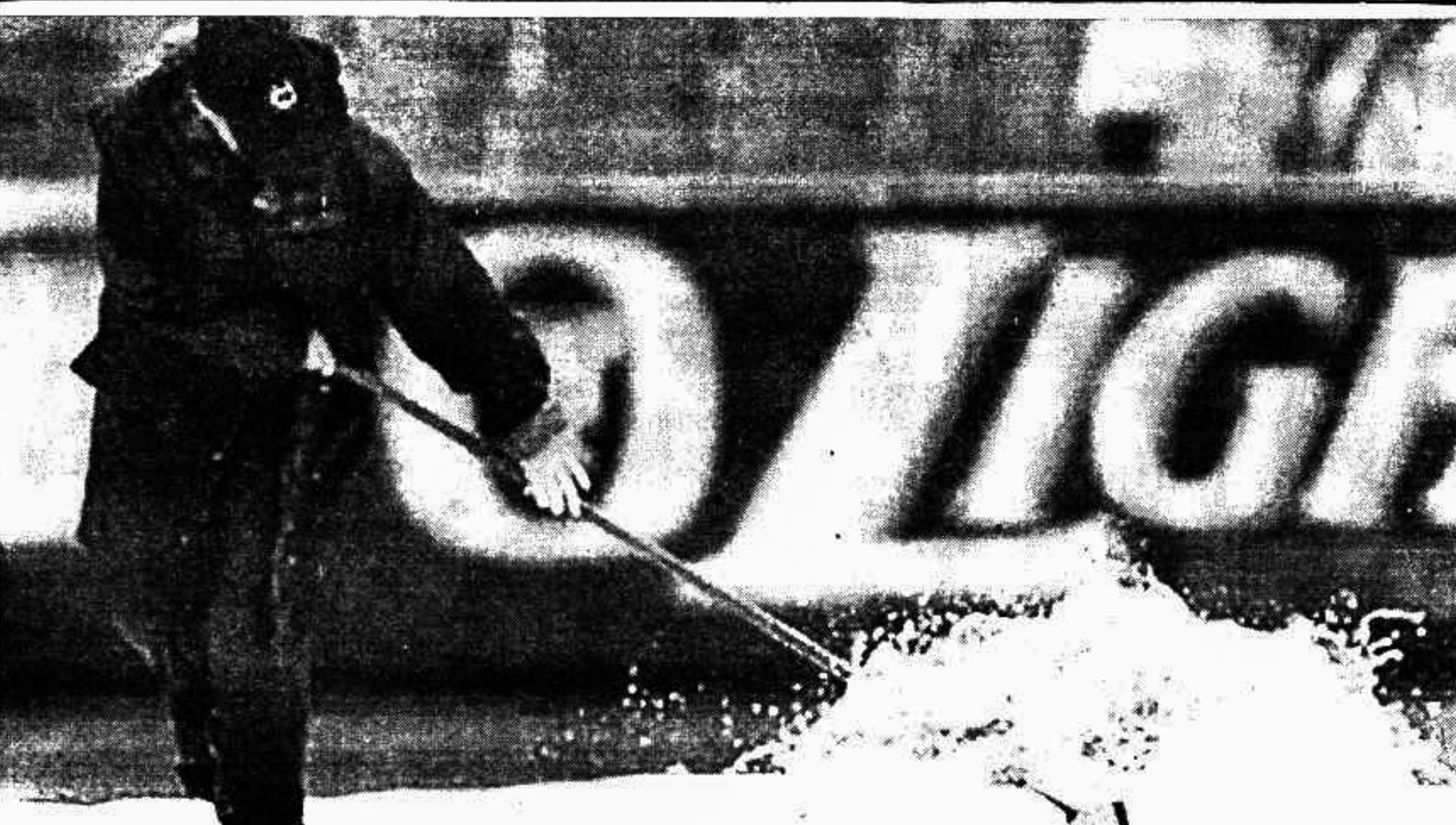
A groundsman wiping water at the Melbourne Cricket Ground where heavy rain postponed the second final of the World Series Cup yesterday.