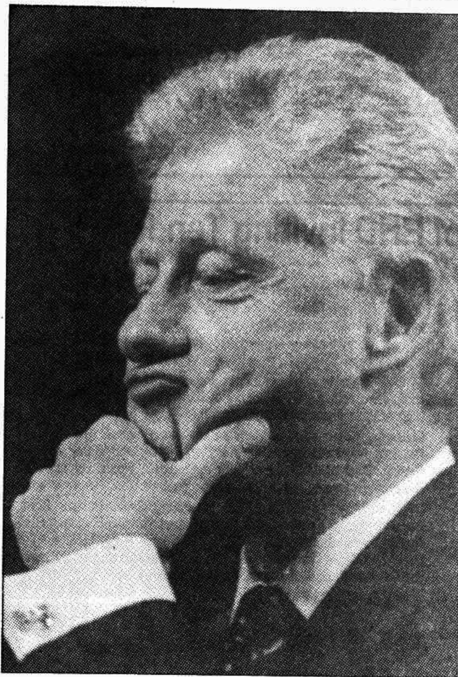
President Clinton

from their seats and declared "guilty" or "not guilty." The Republicans who voted against conviction on perjury were: Slade Gorton of Washington, Susan Collins and Olympia Snowe of Maine, John Chafee of Rhode Island, James Jeffords of Vermont, Richard Shelby of Alabama, Arlen Specter of Pennsylvania, Ted Stevens of Alaska, Fred Thompson of Tennessee and John Warner of Virginia. Republican senators opposing the obstruction article were: Collins, Chafee, Jeffords, Snowe and Specter. Senate Majority Leader Trent Lott offered Democrats a long-shot opportunity to force a discussion of censure immediately after the trial ended — a reminder that even in acquittal Clinton would be forever tarnished as the second president in history to be impeached. The Senate chamber doors, mostly closed for the last four days, were opened for a final vote shortly after noon, ending a fifth week of the trial. Before the votes were taken, the articles of impeachment were read for a final time. Lott declared it was time for senators to fulfill their "obligation under the Constitution." The final outcome of the votes was known for days as five moderate Republicans announced in advance that they