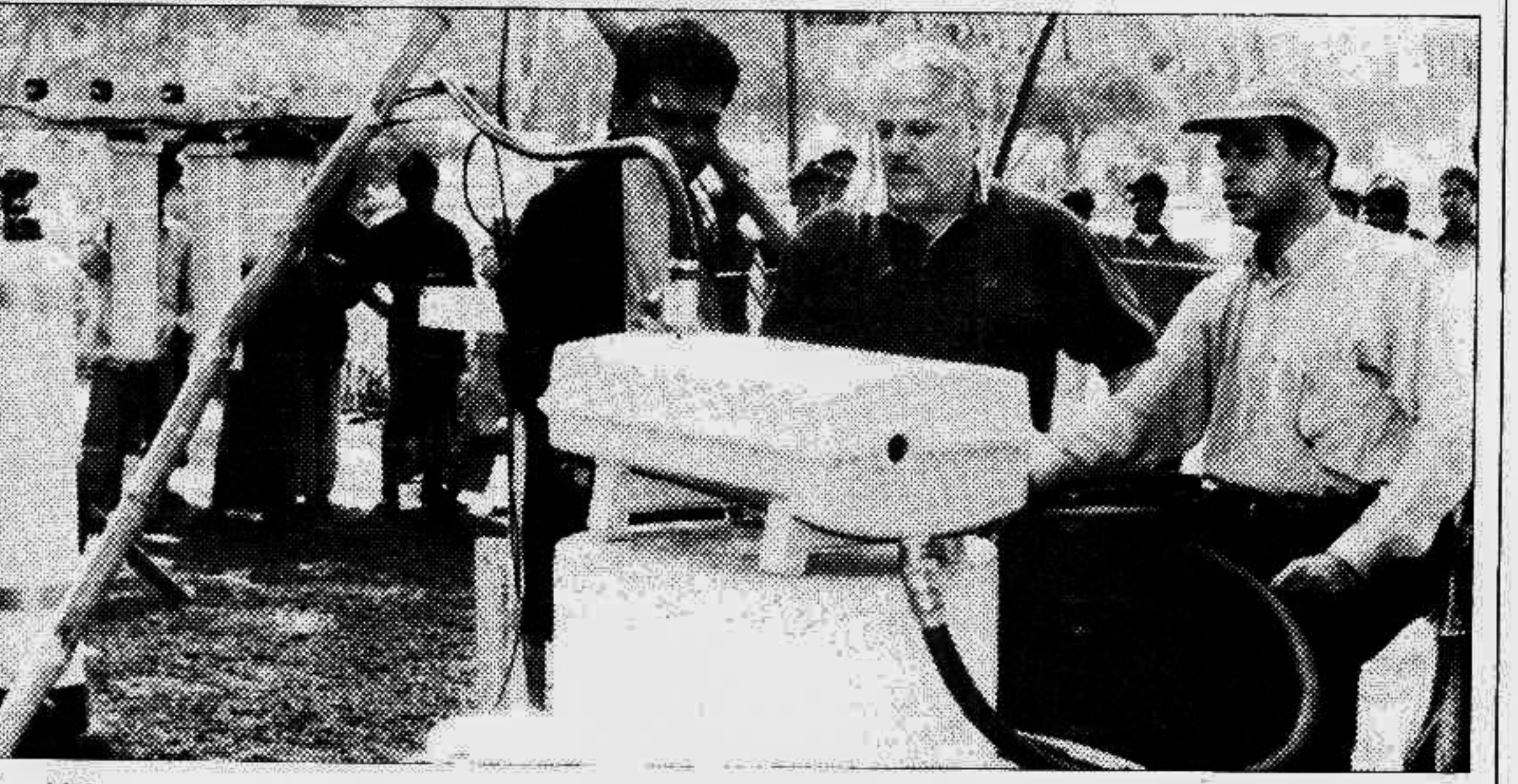
The US govt yesterday announced a 2,50,000 dollar project to promote arsenic treatment system for safe drinking water. The demonstration of a water treatment plant was held at Ramna Park in the city yesterday.