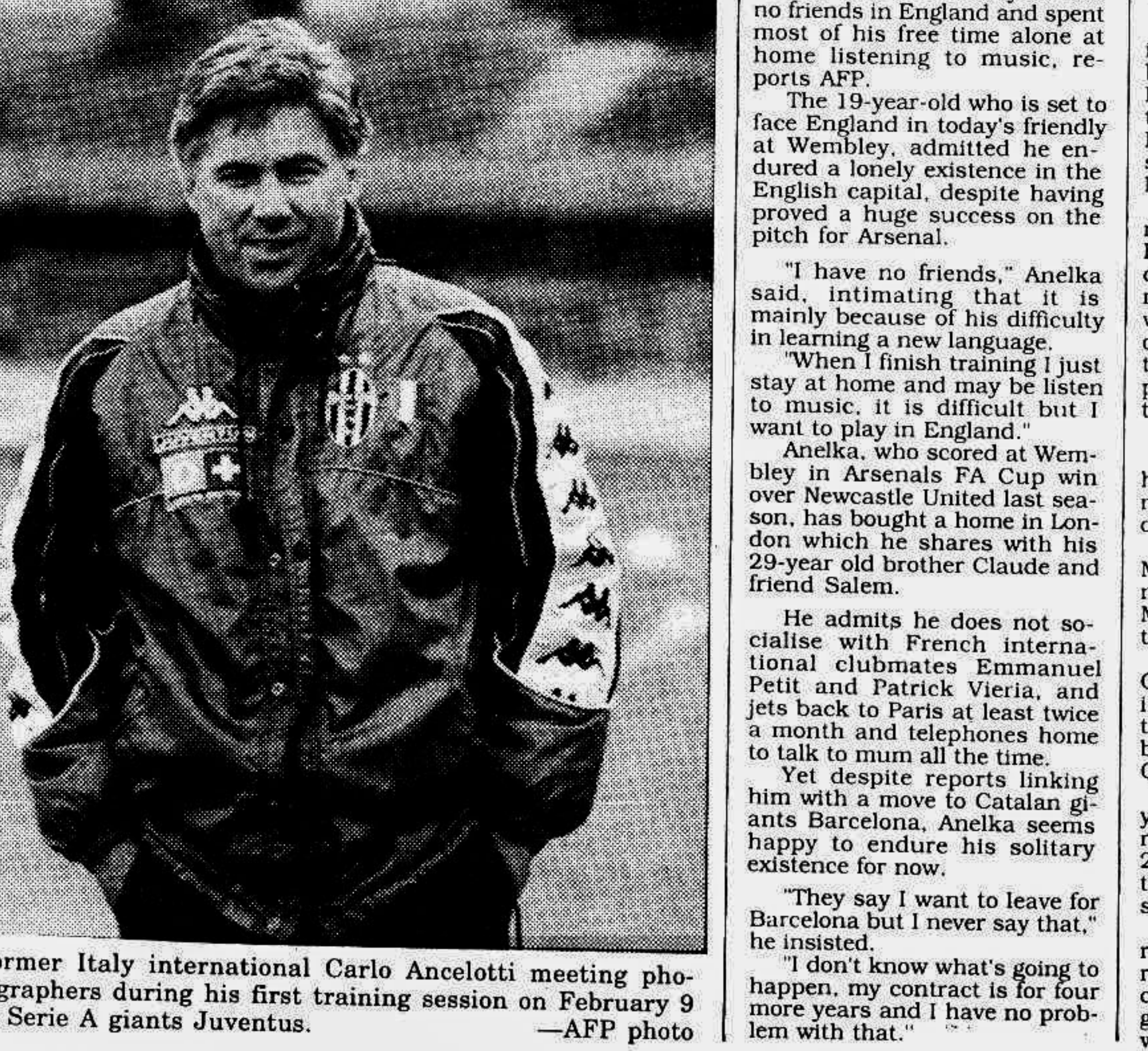
Former Italy international Carlo Ancelotti meeting photographers during his first training session on February 9 at Serie A giants Juventus.