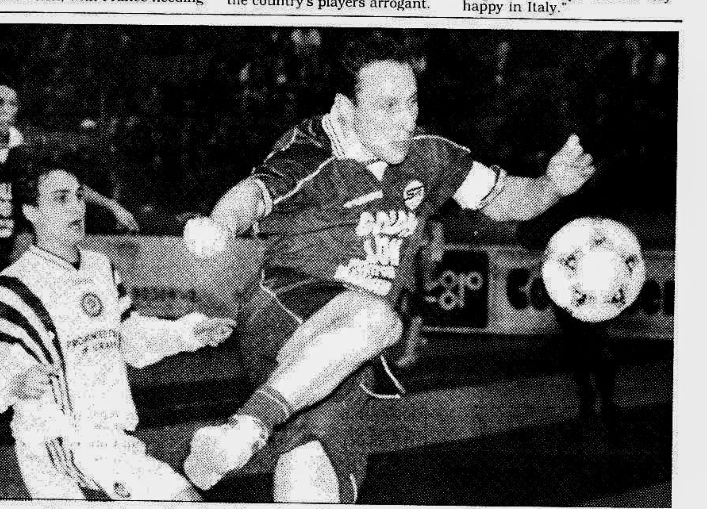
Former French international striker Jean Pierre Papin (R) in action during the Kings' Indoor Tournament match between his Swiss club Servette FC and Ukraine's Dynamo Kiev in Geneva on February 9.