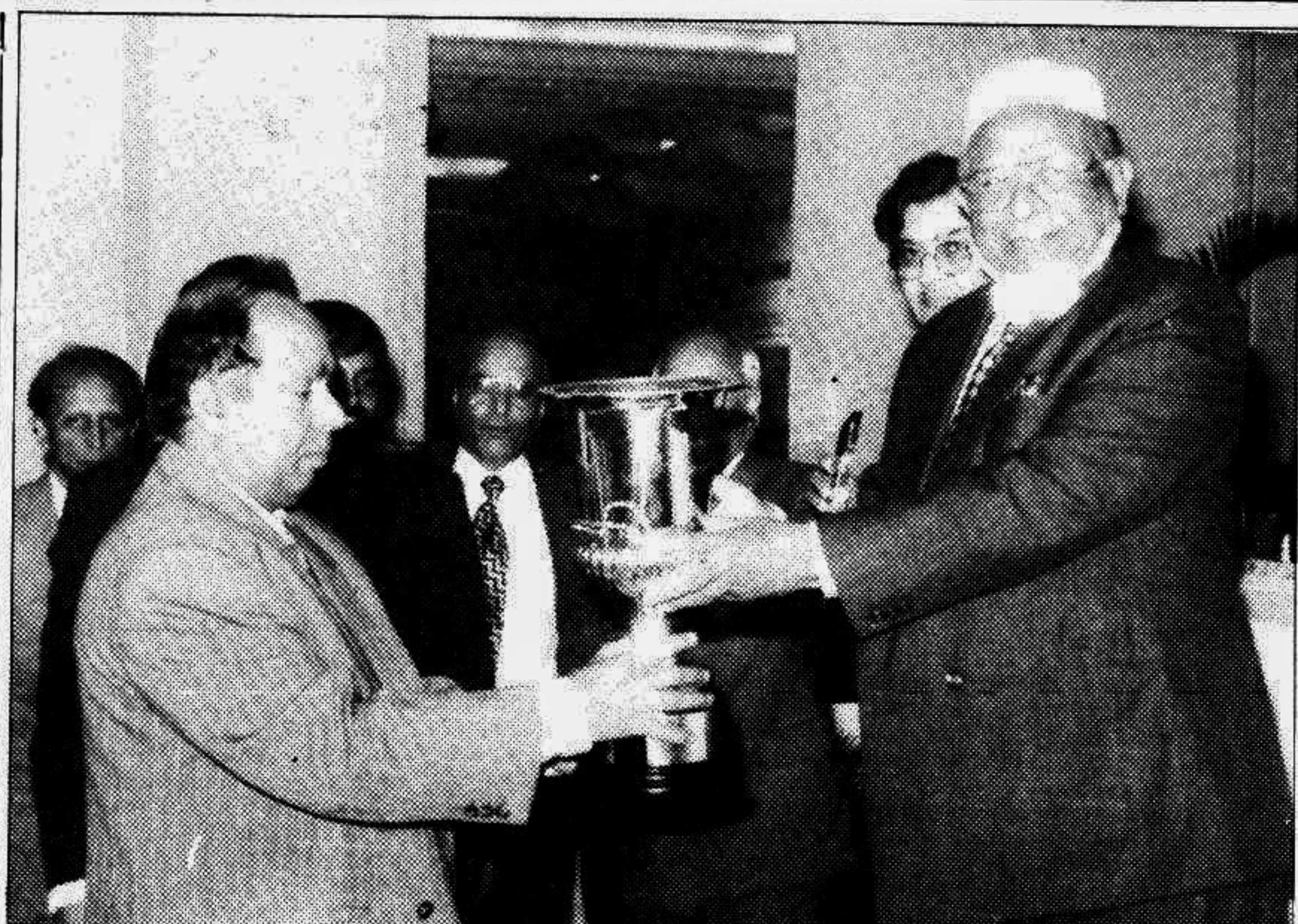
Foreign Minister Abdus Samad Azad handing over the champion's trophy of the second SAARC Bridge Championships to the captain of the Pakistan A team on Tuesday.