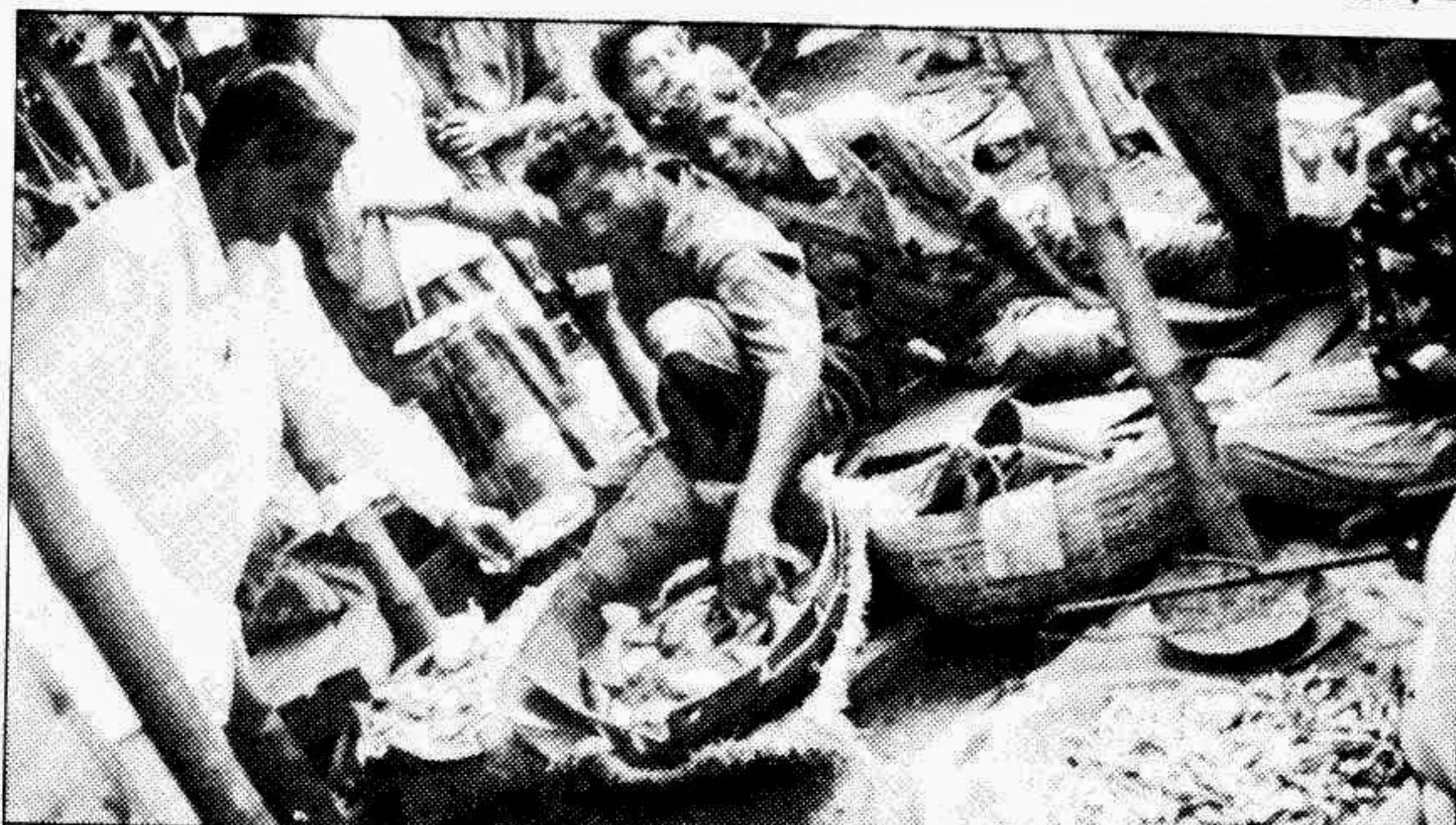
JHENIDAH: Prices have come down considerably due to abundant supply of fish in the local markets in this season.

implementing the programme, he claimed. The district administration is also responsible for creating awareness among the people about the usefulness of ID cards, he said. There has been an adverse reaction among the people due to sudden stoppage of the work in 1996. Many of them refuse to be photographed, another source said. There were about 10,35,976 voters in the district in 1995. The Election Commission claims that 9,12,319 ID cards have already been prepared.