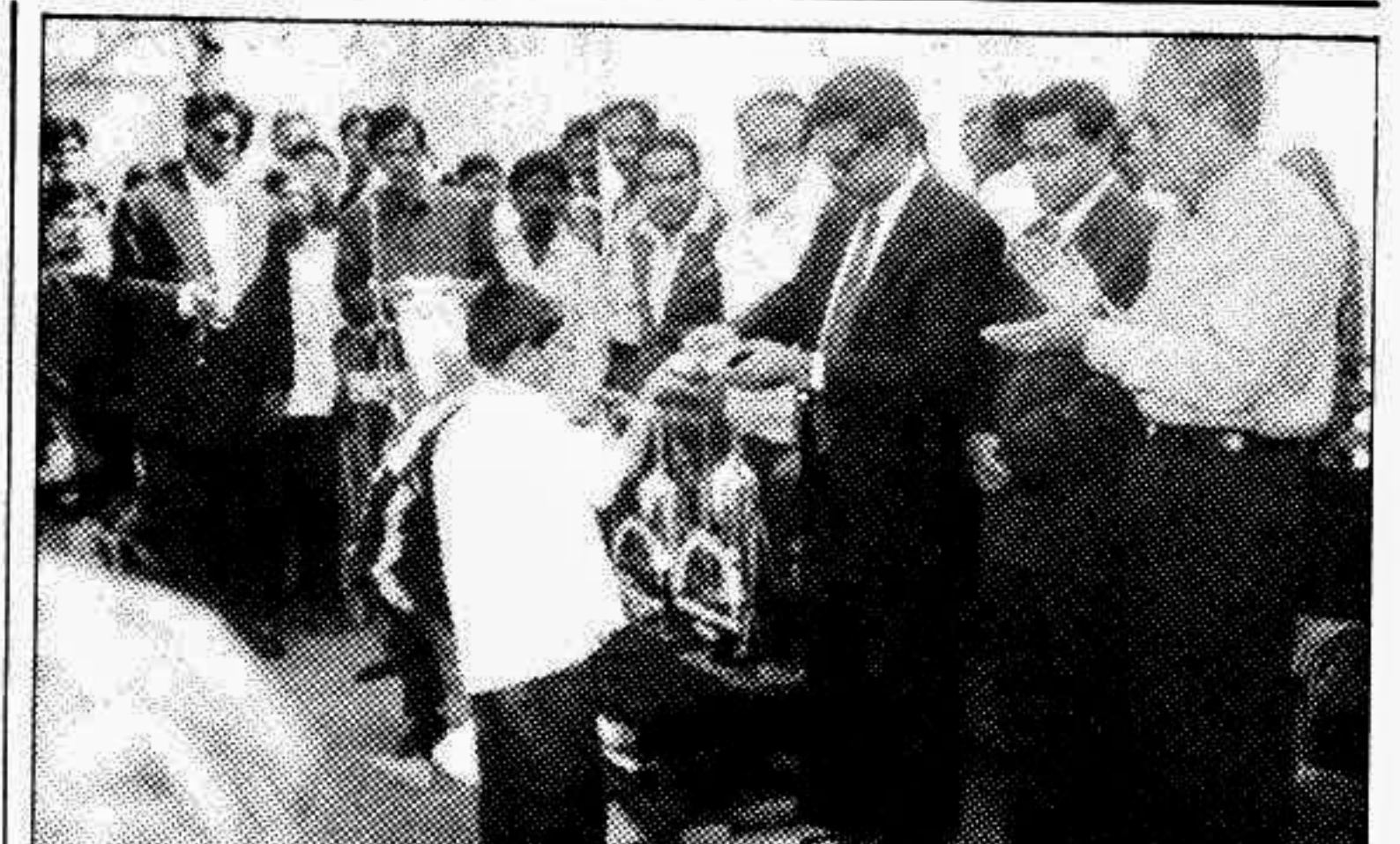
CHANDPUR: Prizes being distributed to the captain of Number Four Government Primary School here who became champion in the annual sports meet.

The case was filed on January 6 after two members of the Union Parishad and some people of the locality submitted a written complaint to the TNO.